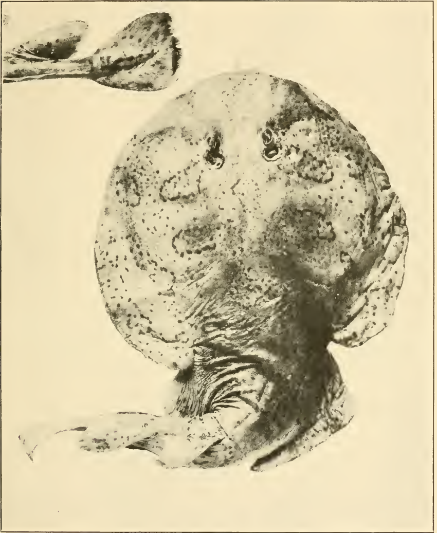
ADULT FEMALE OF NARCINE BRASILIENSIS .