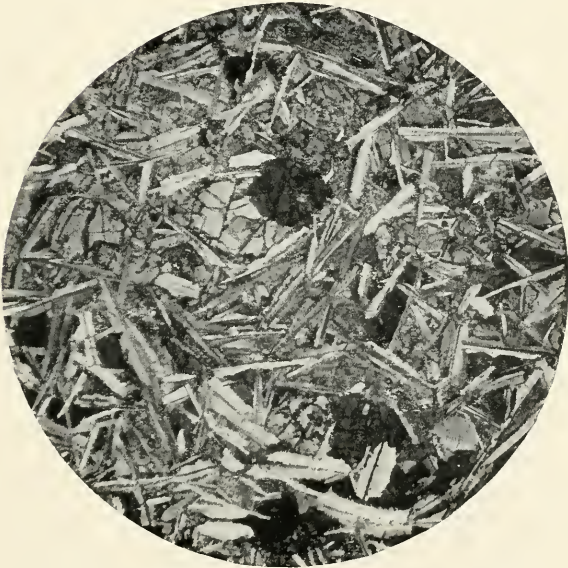
PHOTOMICROGRAPHS OF SECTIONS OF OLIVINE-DIABASE.