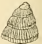
FIG. 2.—NUCLEUS OF ALABA SUPRALIRATA.

any interruption; the first smooth; the rest marked by slender, axial riblets of which about forty-two occur upon each of the last two turns. The spaces separating these axial threads are about twice as wide as the threads. In addition to the axial riblets the last two turns are marked by a slender, spiral cord about one-third of the distance between the sutures, anterior to the summit. Post-nuclear whorls well rounded, appressed at the summit; the first three smooth; the fourth showing fine, irregularly spaced, incised lines, which increase steadily in size on the succeeding turns, becoming very pronounced on the last volutions; on the penultimate whorl there are ten between the summit and the periphery, and these, equally strong, pass over the varices and the spaces between them. In addition to the spiral sculpture, the