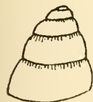
FIG. 4.—NUCLEUS OF ALABA JEANNETTÆ.

Shell elongate-conic, semitransparent, with strong varices scattered at irregular intervals. Nuclear whorls four, continuing the general outline of the spire, well rounded, smooth except for very faint, slender, axial threads which, in most instances, are only apparent at the summit of the whorls. Post-nuclear whorls well rounded, appressed at the summit; the early ones smooth; the later ones marked by slender, incised, spiral lines, of which those on the anterior half of the whorls between the sutures and those on the posterior half of the base are usually stronger than the rest. In addition to the spiral sculpture, the whorls are marked at irregular intervals by strong, oblique varices. Suture strongly constricted. Periphery of the last whorl inflated, well rounded. Base moderately long, well rounded, and inflated, its posterior half marked like the anterior half between the sutures, bearing the feeble extensions of the varices. Aperture very large, broadly oval; posterior angle obtuse; outer lip thin and transparent; columella very oblique and somewhat curved, slightly reflected over the reenforcing base; parietal wall glazed with a thin callus.