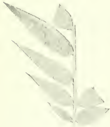
FIG. 2. TWIG OF NAGELOPSIS ZAMIIOIDES SHOWING VARIATION IN FORM AND SIZE OF LEAVES.

While it might seem at first sight that too great a variety of leaf forms had been lumped under this specific name, the great variability of the leaves on single twigs should be kept in mind. The leaves in the type forms are commonly smallest toward the base of the twigs, as they are also in the N. ovata forms. In N. decrescens the basal leaves are one hundred per cent longer than are the succeeding leaves. In the forms described by Fontaine as N. heterophylla the leaves are especially variable, some being identical with those he called N. microphylla , while others are like those he calls N. decrescens , others still simulating his N. ovata and N. zamiioides with two or more of these types present on the same twigs. Others referred by him to N. zamiioides show an equally wide range of variation. I have figured (fig. 2) a specimen labeled N. zamiioides which shows but five leaves,