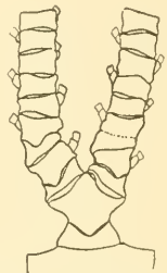
FIG. 4.— HELIOMETRA TANNERI : SHOWING AN ARM WITH THE FIRST TWO BRACHIALS REPEATED.