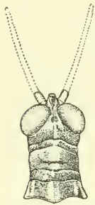
FIG. 4.— PROCTOLABUS BULLATUS . DORSAL VIEW OF HEAD AND PRONOTUM. ( \times 3 .)

half with two longitudinal parallel grooves extending to the apical margin; cerci slightly exceeding the supra-anal plate, subequal in the proximal half, sharply constricted mesad and slightly expanding to the subspatulate apex, the apical portion bent at an angle of about 45^\circ to the proximal half, when viewed from the dorsum the apex is seen to have a very slight sigmoid curve; subgenital plate very large, slightly compressed, the apical margin rectangulate when viewed from the dorsum; a compressed preapical process projects dorsad a distance equal to the depth of the remainder of the subgenital plate. Cephalic and median limbs moderately robust; caudal limbs missing.