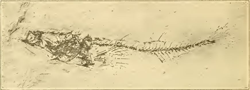
FIG. 1.—SKELETON OF GASTEROSTEUS WILLIAMSONI LEPTOSOMUS . (TYPE) \times 1\frac{1}{2} .

the rays are 10 mm. long. The ventral fins are gone, but a portion of the ventral plate is present. Its outer surface was sculptured. The anal fin is disturbed and a part missing. The caudal is preserved. The length of the fish from the snout to the base of the caudal is 51 mm.; the length of the head, 14.5 mm.; the depth of the body, 9.5 mm. There is no trace of either lateral armor or a caudal keel.