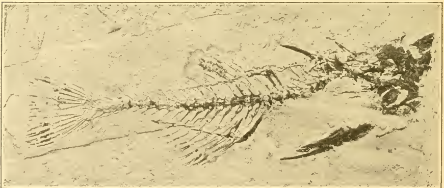
FIG. 2.—NEARLY COMPLETE SKELETON OF GASTEROSTEUS WILLIAMSONI LEPTOSOMUS . \times 14 .

The second (Cat. No. 5387, U.S.N.M.) lacks most of the head (fig. 2). The length from the shoulder girdle to the base of the caudal is 38.5 mm.; the depth is 10 mm. The first dorsal spine is 3 mm. long; the second 5 mm.; the third is short and curved. There are 10 soft dorsal rays. The ventral spines have a length of 7 mm. and the ventral plates a length of 11 mm. The anal spine is short and curved, and there are counted 9 soft rays, with an interhaemal spine for a tenth.