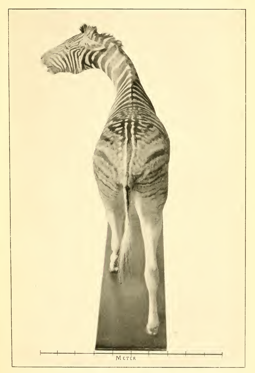
EQUUS BURCHELLII (GRAY). REAR VIEW, FOR EXPLANATION OF PLATE SEE PAGE 3.