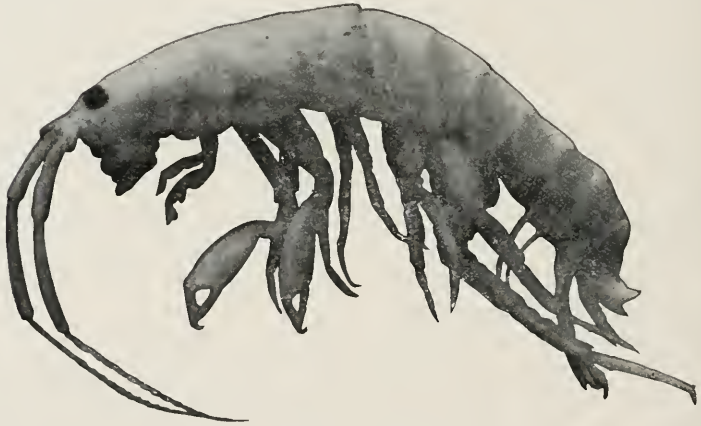
FIG. 1.— ORCHESTIA COSTARICANA , MALE.

The eyes are dark, irregularly rounded, the interval between them less than the diameter of the eye and in large specimens reduced to a very narrow space. The first antennæ do not reach the end of the penultimate joint of the peduncle of the second pair. They have a five-jointed flagellum subequal in length to the peduncle, of which the first and second joints are subequal, broader but not much longer than the third. The second antennæ are slender, with a flagellum of about twenty joints, nearly as long as the peduncle, in which the last joint is considerably longer than the penultimate, more so in the male than in the female. The mouth parts are on the whole all of the character usual in the genus. In the first maxillæ no palp could be detected, but in the female a microscopic notch was seen in the position proper to the base of the palp.