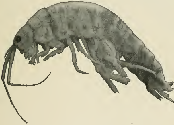
FIG. 2.—ORCHESTIA COSTARICANA, FEMALE.

the fifth apparently quite coalesced with the sixth and consisting of a narrow triangular piece lying alongside the oblong fourth joint. The sixth joint proper has an oblong trunk about twice as long as broad, with the hind margin distally produced into a slender nearly straight thumb about two-thirds the length of the trunk. The finger, somewhat stronger than the thumb, when closed overlaps the pointed apex of the thumb with its own curved and blunt apex, and brings its bulging middle part into contact with the spinulose distal half of the thumb, leaving an irregularly oval gap between the proximal confronting edges of this true chela. It will be noticed in the enlarged figures of the second gnathopod of Orchestia darwini that the proportions and outline of the trunk are quite different from those of the present species, and also that the finger in closing upon the thumb there presents an arrangement which is scarcely more than subchelate. The second gnathopod of the female is not exceptional. The fourth