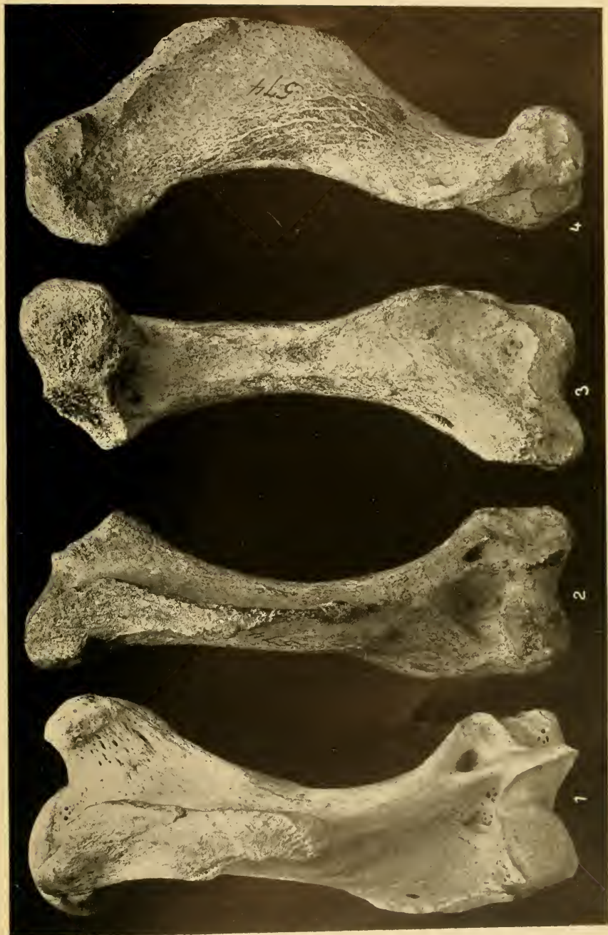
HUMERUS OF LEPTOPHOCA LENIS AND OF PHOCA GRÆNLANDICA.