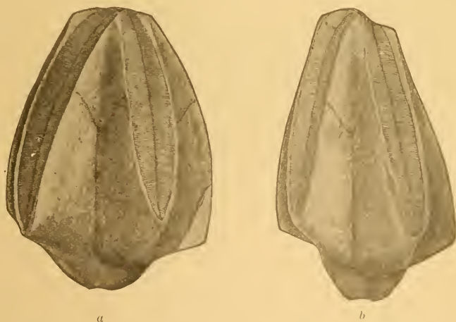
FIG. 1.— a , THE DISTORTED SPECIMEN OF PENTREMITES MACCALLIEI SLIGHTLY TILTED SO AS TO BRING OUT MORE NEARLY THE NORMAL FORM. NATURAL SIZE. b , SIDE VIEW SHOWING AMOUNT OF DISTORTION.

Theca elongate, conical, and very large, having a length of 57 mm. and a width of about 40 mm. Base inverted-cone shaped, large, rapidly