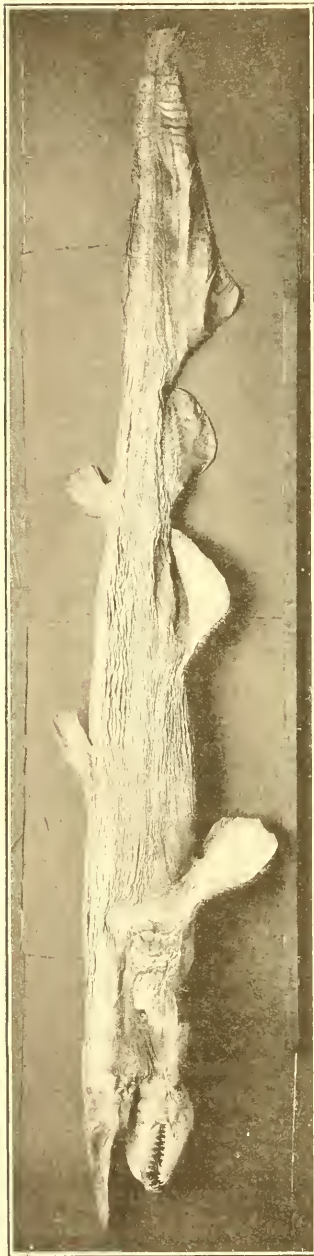
FIG. 1.—GOBLIN SHARK, MITSUKURINA OWSTONI.