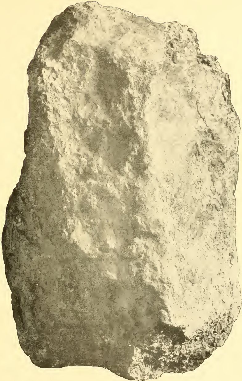
THE MOUNT VERNON PALLASITE.