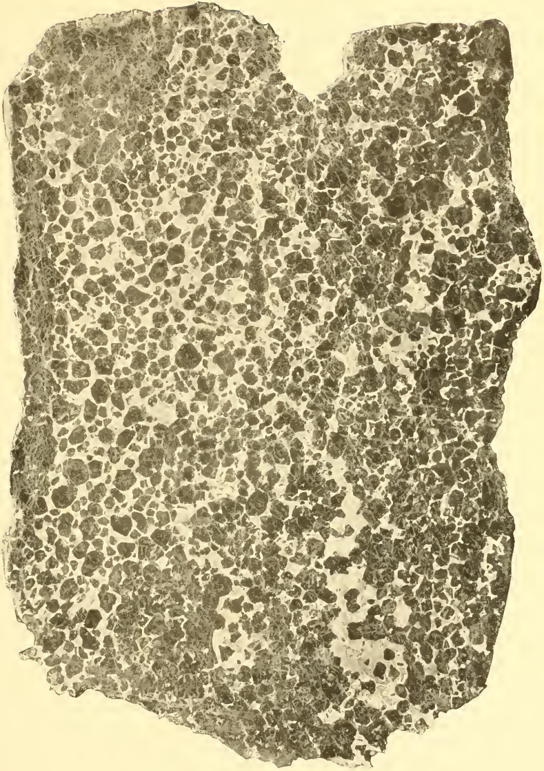
THE MOUNT VERNON PALLASITE.