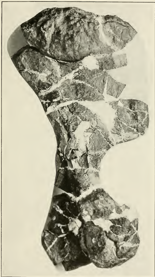
EXTERNAL ASPECT OF RIGHT HUMERUS OF PLACERIAS HESTERNUS. (Type. No. 2198, U.S.N.M.)