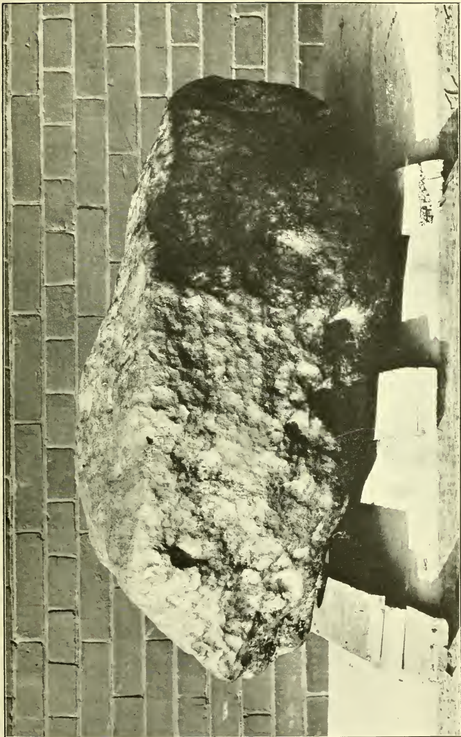
THE CASAS GRANDES METEORITE.