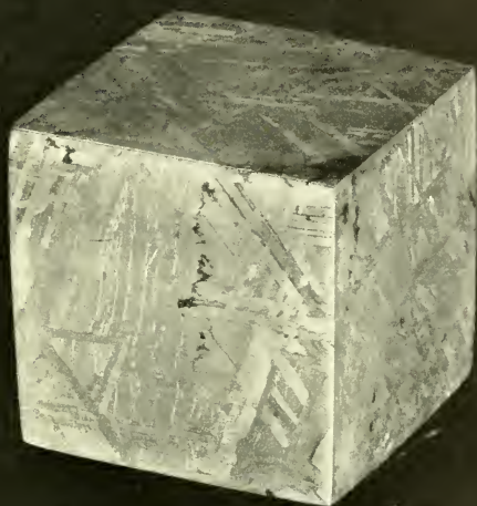
CUBE, ETCHED, OF CASAS GRANDES IRON.

The fine lines in relief are Schreibersite.