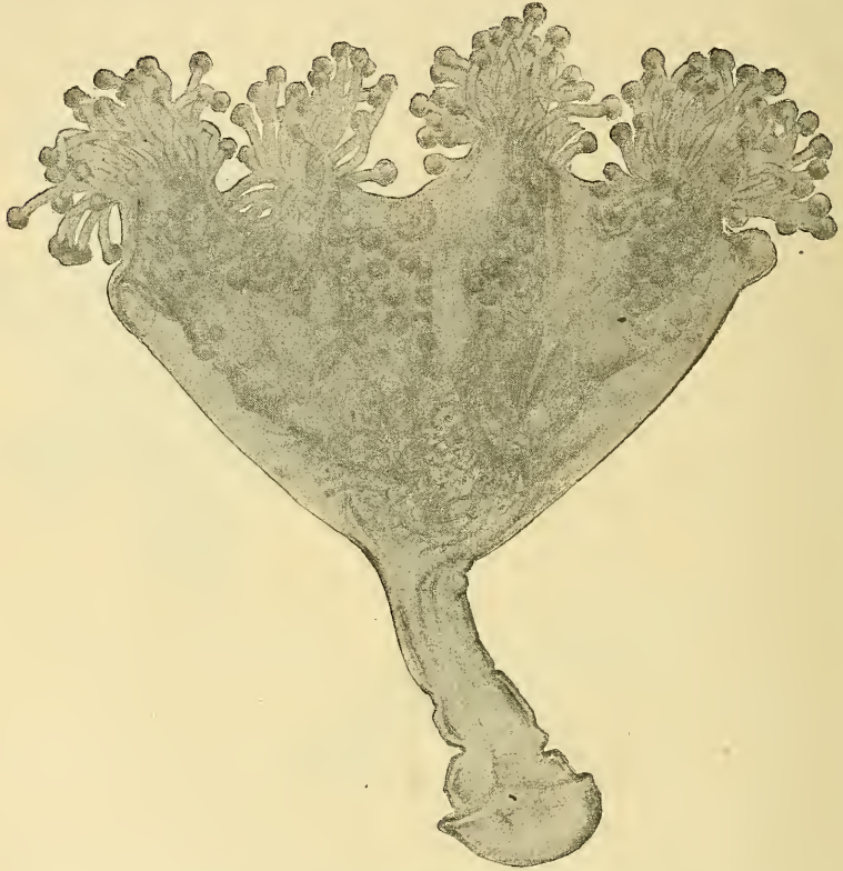
FIG. 3.—HALICLYSTUS STEJNEGERI. AN IMMATURE FORM, 3 MM. IN HEIGHT, DRAWN FROM A PREPARATION IN TRANSMITTED LIGHT.

Small specimens (3 to 4 mm. in umbrella diameter) of the collection differ more or less from larger specimens in the proportion of the parts of the body, number of tentacles, and genital sacs, etc. Generally, smaller specimens have the narrower umbrella, longer peduncle, shorter arms shallower umbrella cavity, fewer and not much crowded genital