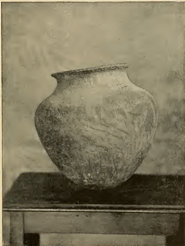
POTTERY FROM SHELL MOUNDS IN FLORIDA. A perfect vessel from Homosassa, holding five gallons.