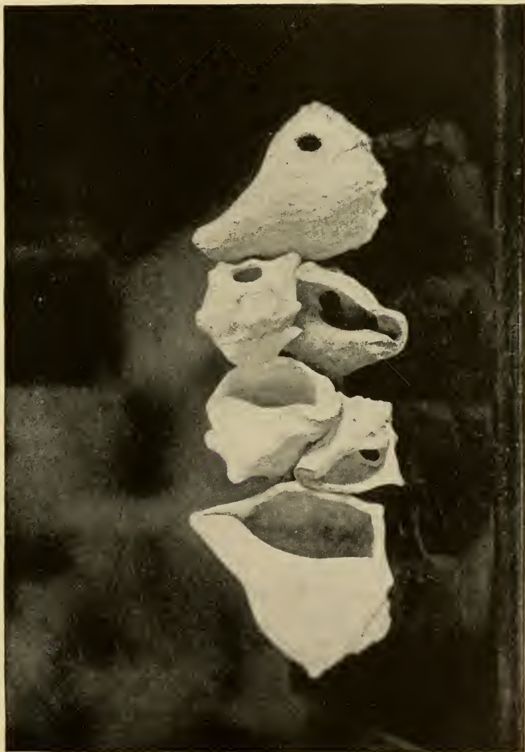
PERFORATED SHELLS FROM SHELL MOUNDS IN FLORIDA. Used probably for dressing skin ; two are prepared for use as clubs.