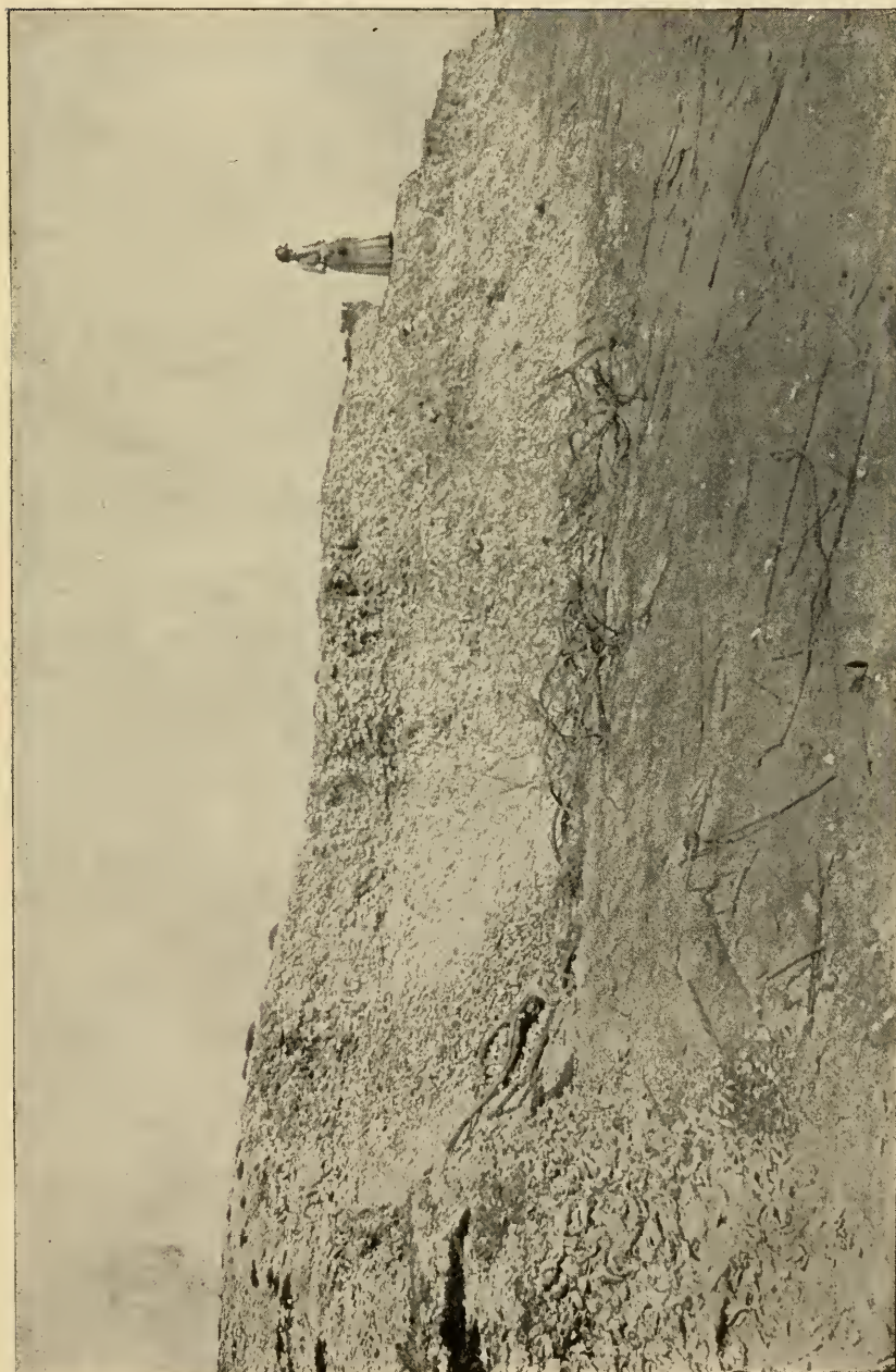
SEA FACE OF SHELL MOUND IN FLORIDA, LOOKING EAST. The sea has washed away a large part of the mound and appears to be making further encroachments every year.