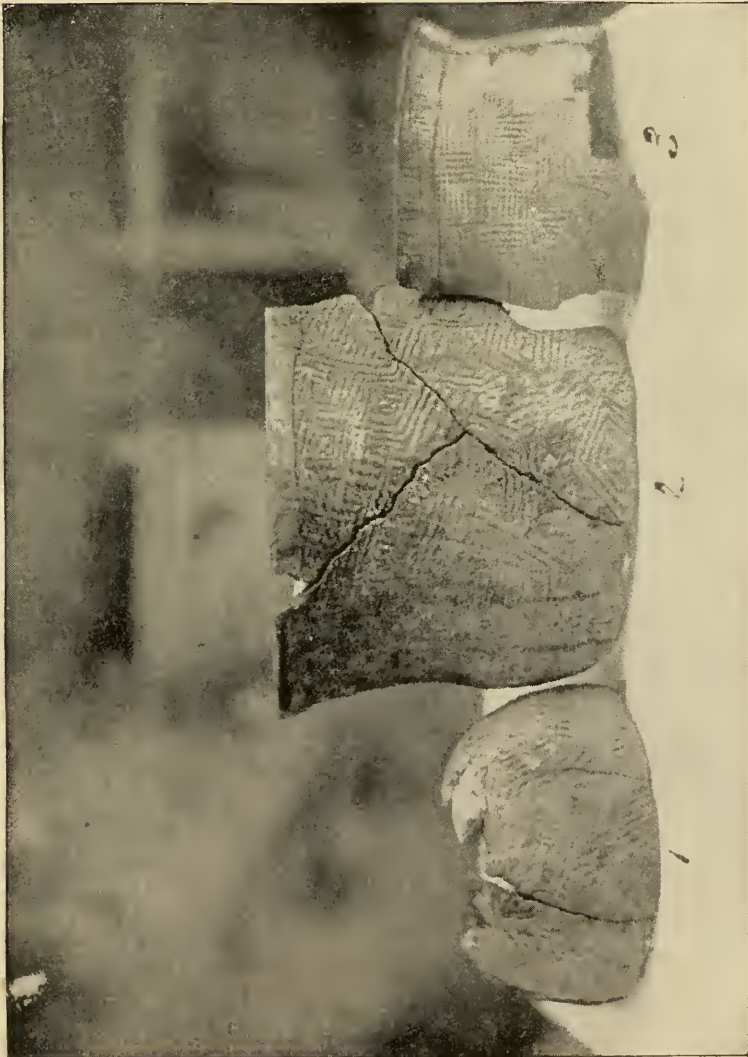
POTTERY FROM SHELL MOUNDS IN FLORIDA. 1. From mound near Old Fort Matanza. 2. From Anastasia Island. 3. From Fitzpatrick's Mound.