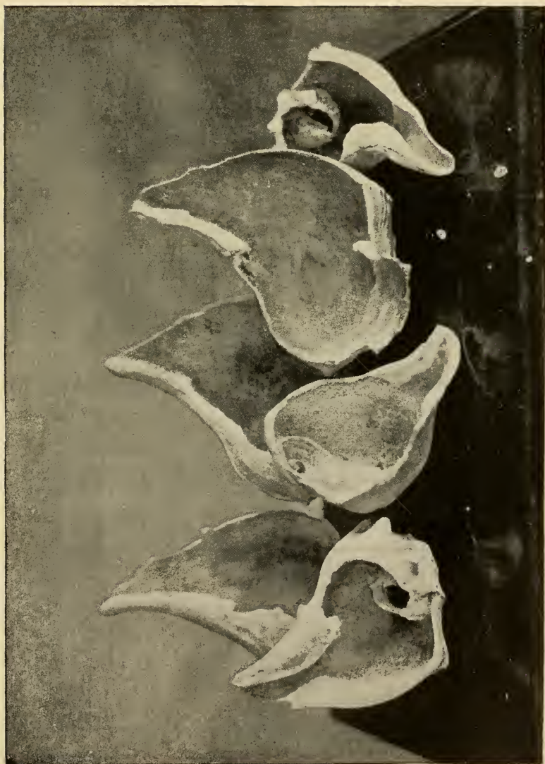
DRINKING-SHELLS FROM MOUNDS IN FLORIDA.