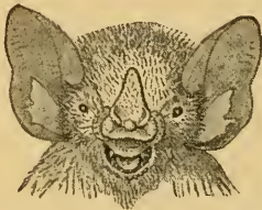
FIG. 1. Front view of head of Ectophylla alba ; 1\frac{1}{2} times natural size.

Characters of the single species that of the genus. Above, the hair is of a dull whitish hue, and unicolorous to the level of the shoulder. Through the rest of the back the hair is of a duller shade of white, except the tip, which is fawn. Below, the coloration is much the same as above, but the sides of the trunk, from the shoulders to the rump, are unicolorous dark fawn, while the median part is whiter. Owing to the humeri being broken and the wing membranes distorted, it is