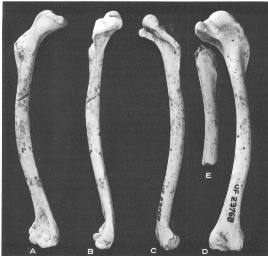
Fig. 2. a-d, right humerus of Xenicibis xympthecus , UF 23768; a, palmar-internal view; b, internal view; c, external view; d, anconal view. e, paratypical fragment of shaft of right humerus of Xenicibis xympthecus , AMNH 11031. All figures natural size.

proximal surface of external tuberosity 27.0, least width of shaft 6.2, width of shaft at midpoint 7.1, depth of shaft at midpoint 5.8, width of distal end 16.2, depth through external condyle 10.0, greatest diameter of brachial depression 9.8.