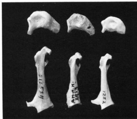
FIG. 3. Coracoids of woodcocks: end-on view of head (top row; 2 \times ) and ventral view (bottom row; 1 \times ). Left to right: Scolopax rusticola , S. anthonyi , S. minor .

species in the more expanded base of the procoracoid and the deeper sterno-coracoidal impression.