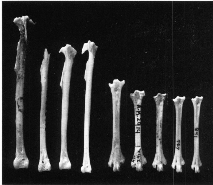
FIG. 4. Anterior view of hindlimb elements of woodcocks and snipe. Left to right: tibiotarsi of Scolopax rusticola , S. anthonyi , S. minor , Capella gallinago ; tarsometatarsi of S. rusticola , S. anthonyi (2 individuals), S. minor , C. gallinago . Natural size.

before the North American population of Scolopax had evolved the advanced conditions now seen in S. minor . Thus, S. anthonyi preserves the primitive features still found in the Old World forms of Scolopax . It must have been resident in Puerto Rico for a considerable period of time.