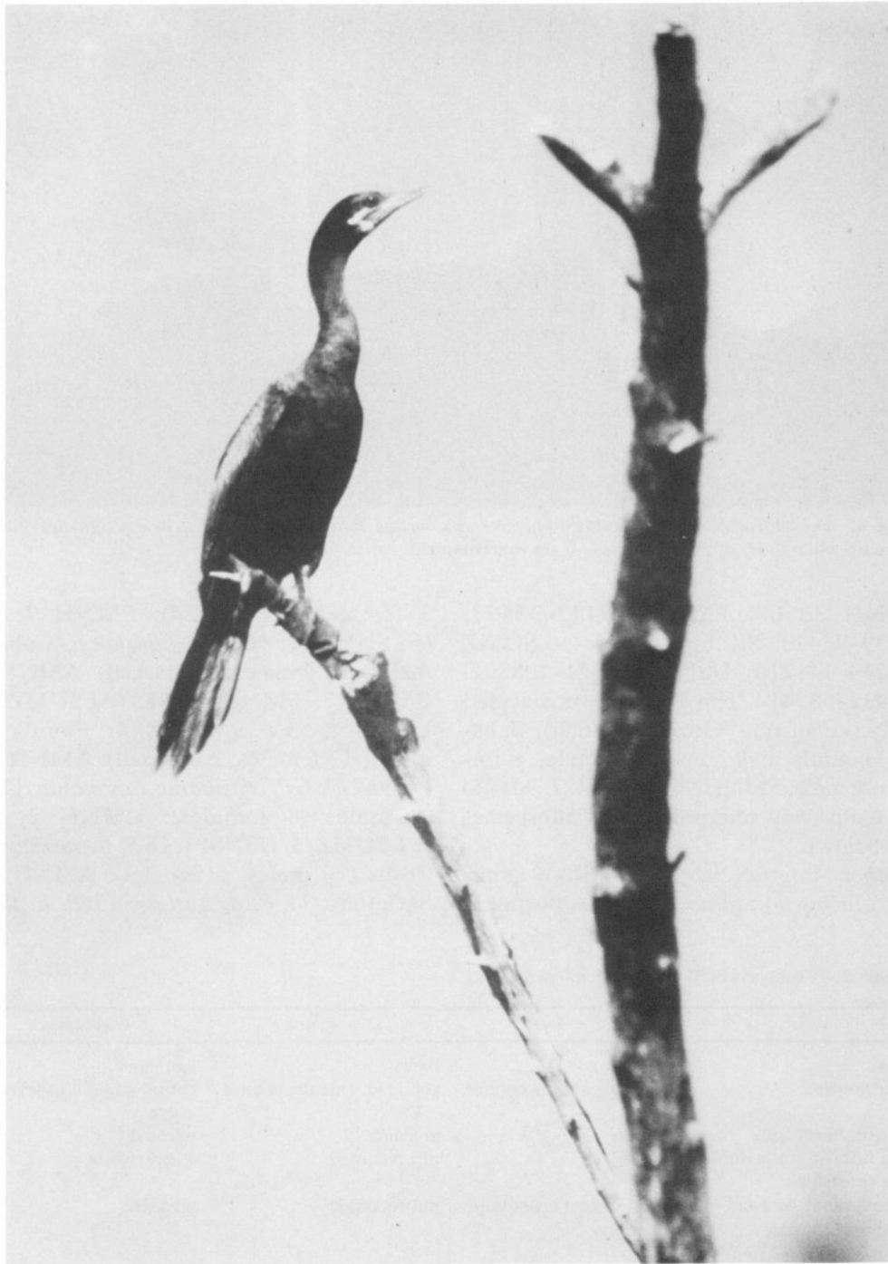
Fig. 3. Adult Phalacrocorax brasilianus in breeding plumage, on Cat Island 1 December 1978 shows all-dark lores and the conspicuous white feathering on cheek and posterior margin of the throat pouch.