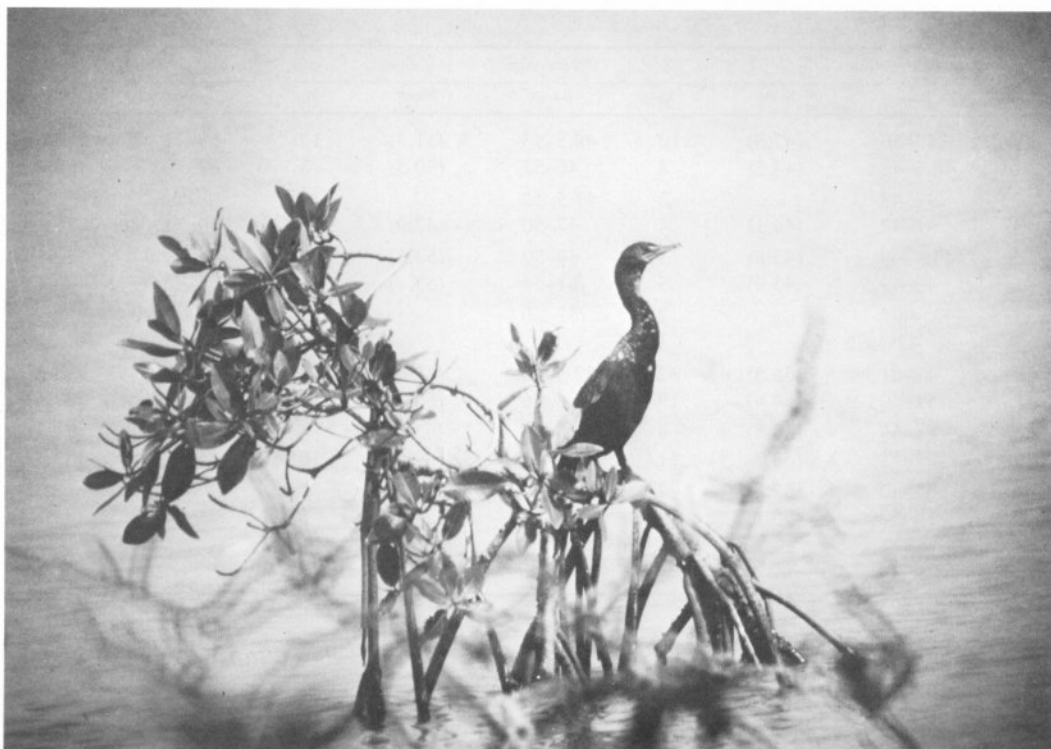
Fig. 2. Subadult Phalacrocorax auritus heuretus on San Salvador, Bahama Islands, in 1981 shows pale lores and inconspicuous light feathering at posterior margin of throat pouch.

Most of the recently-collected specimens were prepared as complete skeletons and flat skins. Because size is the only character distinguishing the new subspecies, and skeletons provide many more measurements (and more accurate ones) than traditional study skins, a complete skeleton and flat skin has been designated holotype of the new subspecies.