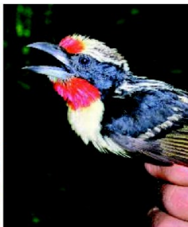
Different fates. The harlequin toad is one of many species that require old-growth forest, whereas the black-spotted barbet can survive in regenerating forest.