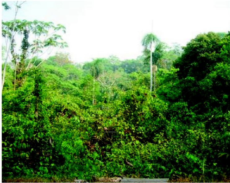
New growth. When cleared land is left alone, secondary forests like this one in Mato Grosso, Brazil, can take hold.

Most of the research on secondary forests has been done in Costa Rica and other Mesoamerican countries, where original forests were mostly converted to agriculture decades ago. Patches of that land have slowly reverted to forests, whereas the remainder remains in cultivation. Such studies have