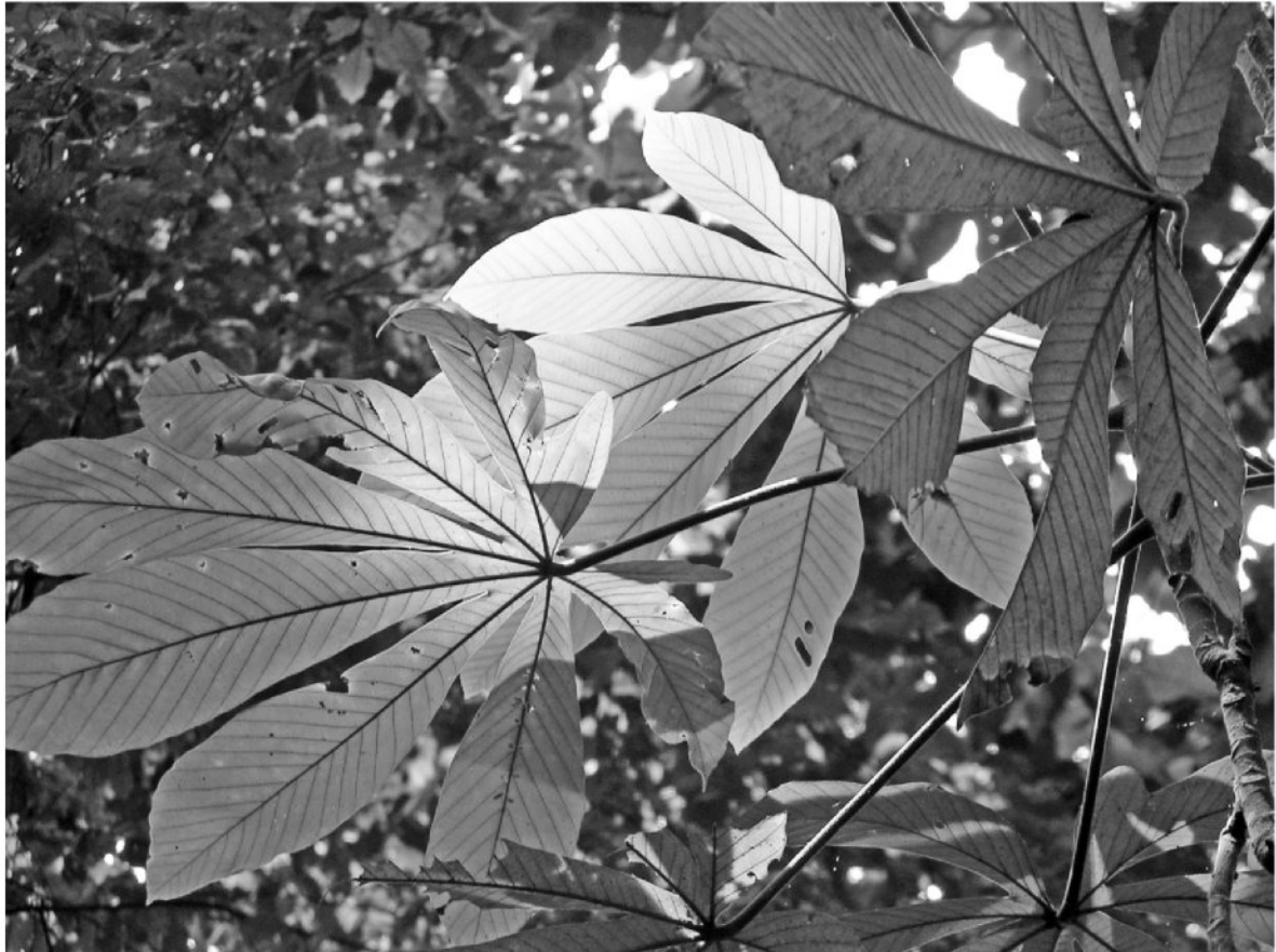
PLATE 1. Pourouma cecropiifolia leaf capturing sunlight in the La Chonta forest, Bolivia. A high specific leaf area is important to enhance the leaf display per unit of leaf biomass invested.

analysis was also carried out for the two sites (La Chonta and BCI) that had complete data for a sufficient number of species. Relative growth rate was negatively related to WD for La Chonta ( r^2 = 0.29 ) and negatively related to WD, SLA, and SV for BCI ( r^2 = 0.42 ; Appendix C).