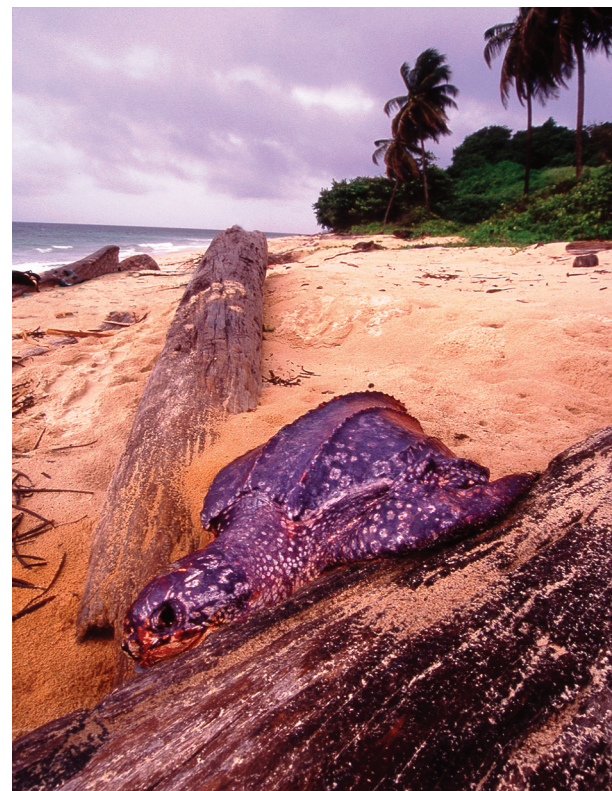
PLATE 2 A female leatherback turtle trapped by beached logs at Pongara Beach. The turtle's eyes were removed by ghost crabs.

In Gabon lost timber on beaches is owned by the government and cannot be legally removed without a permit from the Gabon Forestry Department. This may discourage harvesting of beached logs for timber or firewood by local residents, although we observed some illegal harvesting. Revoking the current restriction on harvesting beached timber could potentially facilitate log removal but such operations may degrade beaches if tractors or other heavy equipment are not used carefully. One option would be to allow local communities or contractors to remove timber from critical nesting beaches but only under the supervision