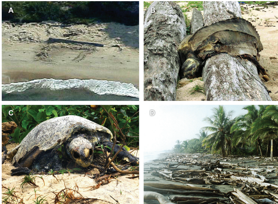
PLATE 1 (a) Video image showing an aborted nesting attempt by a marine turtle after being blocked by a beached log; remains of a (b) female leatherback turtle and (c) female olive ridley turtle that became trapped and died at Pongara Beach; (d) densely accumulated driftwood, which results in part from nearby deforestation, at Gandoca Beach in Costa Rica.

include the deleterious effects of logs on hatchlings, which emerge at night and are vulnerable to terrestrial predators as they head to the sea. Hatchlings that are impeded or confused by logs are likely to suffer increased crab and seabird predation, or be killed by heat exhaustion if they are unable to reach the sea before daytime. Circumventing log barriers could also sap the limited energy from nestlings needed in the swimming frenzy that allows them to escape coastal waters rich in predators. Secondly, it does not include the potential for wave-tossed logs to crush adult and hatchling turtles, as has been observed for other coastal wildlife such as crocodiles (Pauwels et al. , 2004). Given such limitations in our analysis, it would be highly desirable to expand future studies of turtle-log interactions in scope and duration, and to include other critical nesting beaches, such as Mayumba, in these investigations.