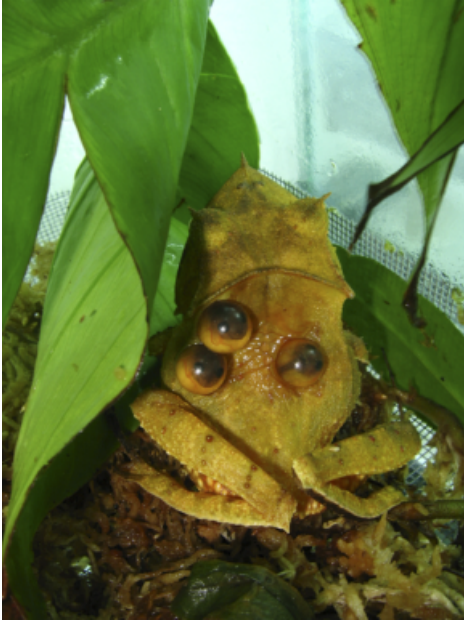
Plate 2. Casque-headed frog Hemiphractus fasciatus . Edgardo Griffith, El Valle Amphibian Conservation Center.