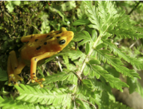
Plate 1. Panamanian golden frog Atelopus zeteki.