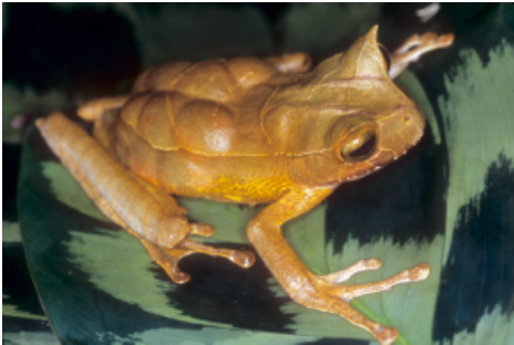
Plate 3. Horned marsupial frog Gastrotheca cornuta . Gravid ♀ with eggs in pouch. Ron Gagliardo, Atlanta Botanical Garden.

successful breeding events, have proved difficult in terms of raising juveniles to adulthood owing to nutritional issues. This indicates that there is still much to learn about the captive care of many species.