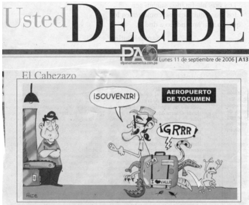
Fig. 2. Clipping from Panamanian newspaper showing ‘mixed emotions’ of having their animals exported. Usted Decide , 11 September 2006.

the ARCC, a gradually changing budget likely worked better under these circumstances because of the nature of the project. If the budget had been tightly restricted and not been allowed to grow to match the changing goals of the project, it may well have failed.