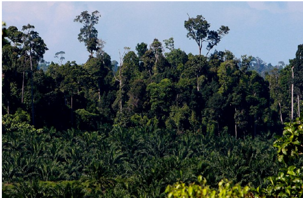
Fig. 4. Oil palm plantation adjacent to tropical forest in Sabah, Malaysia.