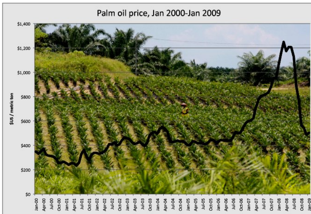
Fig. 1. Palm oil prices, January 2000 – January 2009-02-27. Palm oil prices from January 2000 to January 2009 (from [47]).

Yet few realize that oil palm could soon drive similar forest loss in Amazonia, the world's largest expanse of tropical forest. Here we briefly describe the confluence of factors that could promote a sharp increase in oil palm agriculture in the region. Although the crop is being established in various parts of Latin America, we focus here on Brazil, where geographical, political, and corporate forces appear particularly aligned to pursue the aggressive expansion of an oil palm industry. We argue that, contrary to prevailing public discourse in Brazil, oil palm expansion would constitute a serious threat to Amazonian ecosystems and their associated biodiversity.