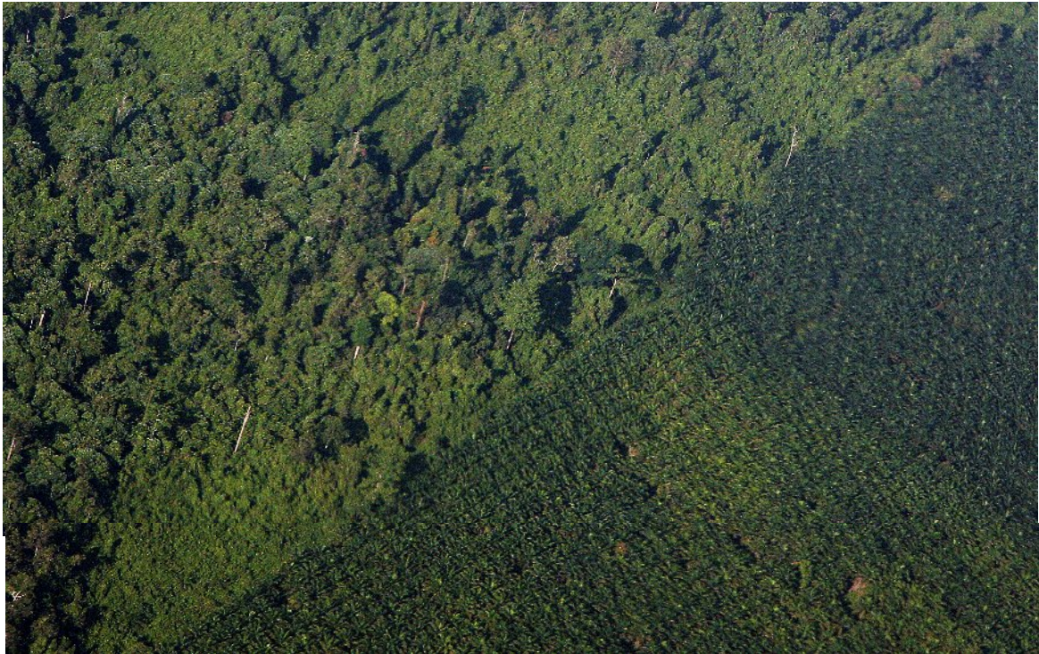
Fig. 3: Oil palm plantation adjacent to tropical forest in Sabah, Malaysia.

Key ecosystem services are also seriously diminished in oil palm plantations. On average, such plantations store less than 40% of the carbon found in native forests (assuming typical above-ground carbon values of 75 tons \text{ha}^{-1} for oil palm plantations and 200 tons \text{ha}^{-1} for native forest; [23-25]). At present, intact forests in the Amazon are a massive carbon stock, with forested lands suitable for oil palm storing around 42 billion tons of carbon [4], an amount equivalent to all global, anthropogenic carbon emissions for six years. Thus, large-scale expansion of oil palm production into forested areas could have serious, long-term impacts on carbon storage [25; 26] and other ecosystem services in the Amazon.