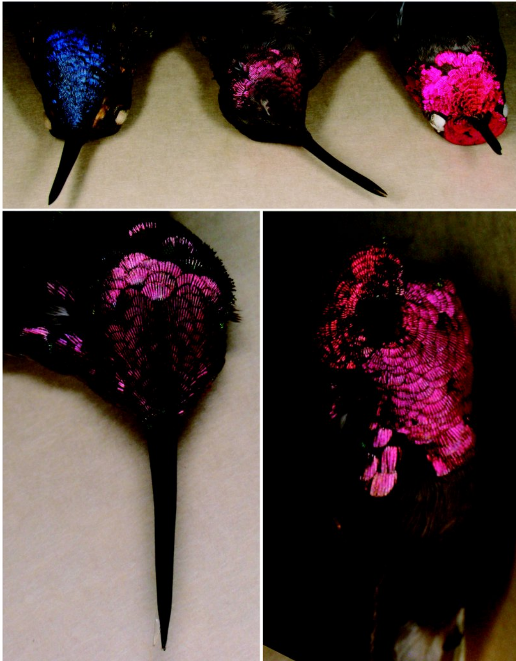
Fig. 2. Top panel: ventral views of adult males: (left) Lampornis clemenciae ; (middle) a probable hybrid, Lampornis clemenciae × Calypte anna (University of Arizona 9359), and (right) Calypte anna . Lower left panel: coronal iridescence of hybrid. Lower right panel: head-on view of hybrid.

Huachuca Mountains and neighboring mountain ranges in southeastern Arizona and Sonora (Swarth 1904, Phillips et al. 1964, Russell & Monson 1998). Although