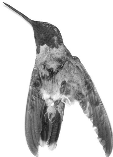
Fig. 1. Ventral view of a probable hybrid, Lampornis clemenciae × Calypte anna (University of Arizona 9359).

plumage as judged by the smooth maxillary ramphotheca and the presence of a large iridescent gorget and coronal patch. Consequently, all description in this paper refers to definitive male plumage. Given the migratory behavior of North American hummingbirds, the Ramsey Canyon specimen could have been hatched at some distant location (e.g., California or Sonora, Mexico). Thus, I compared the specimen with series of all trochiline species (National Museum of Natural History, Smithsonian Institution) that regularly breed in California, Arizona, Sonora, and northwestern Chihuahua (Friedmann et al. 1950, Phillips et al. 1964, Howell & Webb 1995, Russell & Monson 1998): Calypte anna , C. costae (Costa's Hummingbird), Selasphorus platycercus (Broad-tailed Hummingbird), S. rufus (Rufous Hummingbird), S. sasin (Allen's Hummingbird), Stellula calliope (Calliope Hummingbird), Archilochus alexandri (Black-chinned