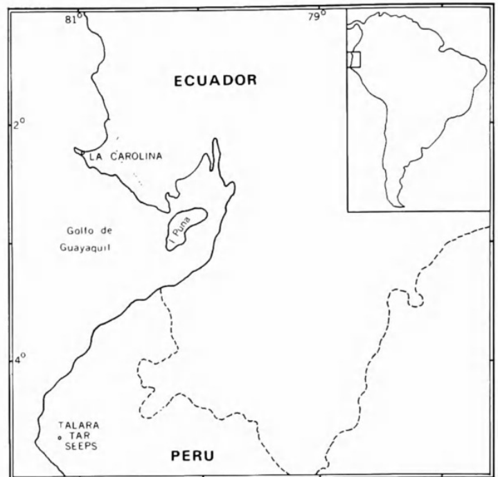
FIGURE 1.—Location of the La Carolina fossil site, southwestern Ecuador, relative to the Talará Tar Seeps of northwestern Peru. The dotted line marks the approximate eastward limit of the arid zone of the Santa Elena Peninsula.

REMARKS.—This new genus and species of Anatidae is being described as a form of Tadorninae