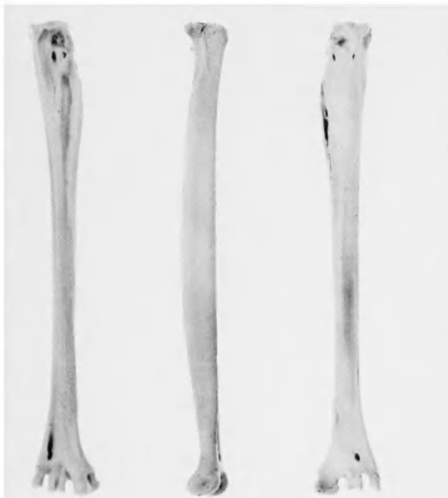
FIGURE 2.—Holotype right tarsometatarsus of Buteo hoffstetteri , new species (uncataloged), in anterior, external, and posterior view, \times 1 .

cur in South America, it was used in the diagnosis because its tarsometatarsus resembles that of B. hoffstetteri in being long and slender rather than short and stout. While the tarsometatarsus of B. polyosoma is the same length as that of B. lineatus , it is much more robust. In all other species of Buteo with tarsometatarsi of similar length, the bone is even more robust than in B. polyosoma and these species must therefore also differ from B. hoffstetteri .