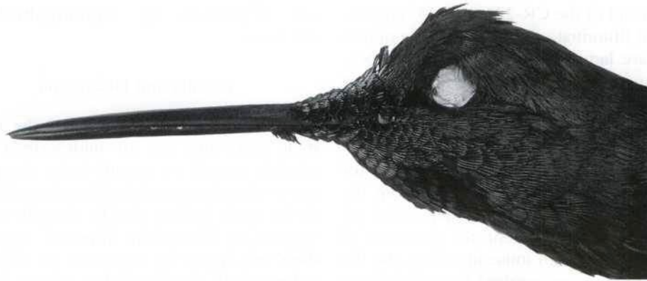
Fig. 1. A probable hybrid, Heliodoxa imperatrix × H. jacula jamesoni (BMNH 1902.3.13.2211).