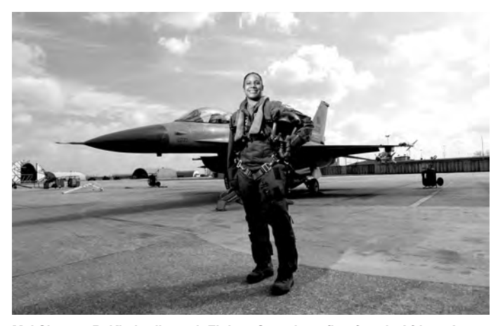
Maj Shawna R. Kimbrell, 555th Fighter Squadron, first female African American fighter pilot in USAF history and former member of the Parker Composite Squadron, Colorado Wing, CAP.

head in the media, the USAF suffered undesirable guilt by association. The CAP cadet program and search and rescue operations, however, benefited Air Force efforts and necessitated finding a working solution.