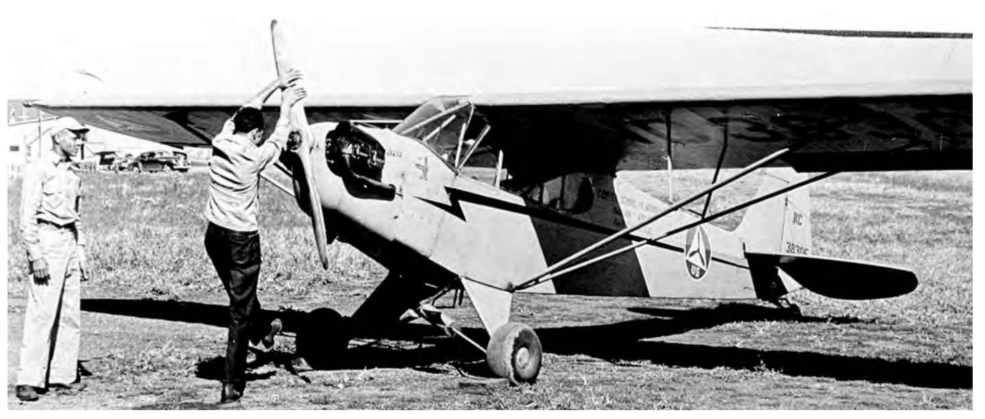
A student of the Coffey School of Aeronautics hand starting a Piper J-3 Cub while an instructor looks on at Harlem Airport, Oak Lawn, Illinois. The aircraft was also used by the 111th Flight Squadron, later Squadron 613-6.

National Headquarters reported the encampments came together without incident.<sup>18</sup>