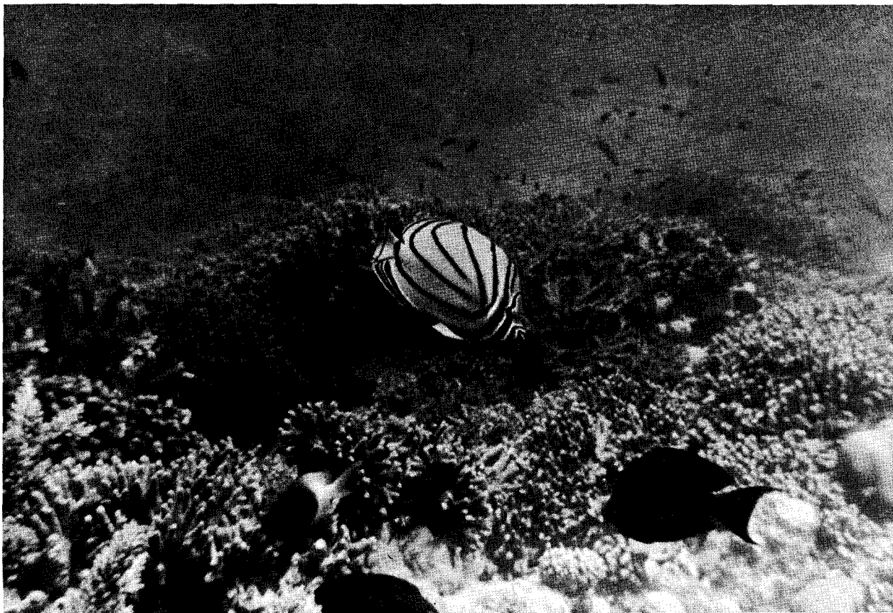
FIG. 3. A Butterfly-fish ( Chaetodon meyeri ) about 12 cm long in centre, and a 'forest' of branching corals, at a depth of ca 7 metres off Middle Island, Aldabra. A Surgeon-fish ( Ctenochaetus cf. striatus ) is prominent on right below, and others are visible to the left. A typical mixture of small fishes is seen in the background.

island of Juan da Nova in the Mozambique channel, our discovery of the real paucity of remaining virgin reefs in this region is nevertheless notable. Clearly the coral reefs, with their great diversity of biota (Fig. 3 above), have at least a poor degree of homeostasis when it comes to the depredations of Man. The usual fishing method (a line, a weight, and a hook baited with a strip of fish flesh) by its very nature selects predatory species. The reduction in predators and thus of predation pressure due to continued use of this method, may have had far-reaching effects on reef ecosystems as a whole. Amongst such effects may have been a general reduction in species diversity (Paine, 1966). Indeed, in this age of earth-shrinking and earth-stinking, there can be few areas as virgin as these two that we were fortunate enough to visit.