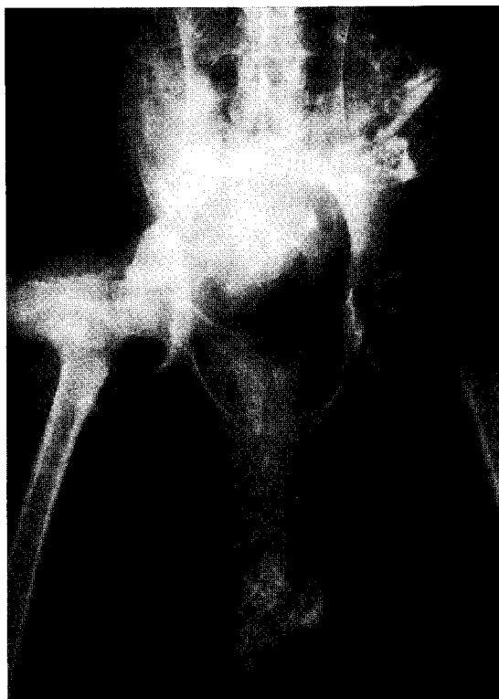
Fig. 3. A peritoneogram demonstrating an inguinal hernia. This herniogram in a male baboon ( Chueropithecus papio ) shows small bowel in the scrotum outlined by contrast material. This is indicative of a right inguinal hernia. No comment can be made about the left side because of inadequate placement of contrast material in this region.

entire processus vaginalis (fig. 2a, b) or only a portion of it may remain patent in the adult primate animal especially in the rhesus monkey. A cystic collection of fluid may occur at any point along the processus vaginalis and produce a hydrocele.