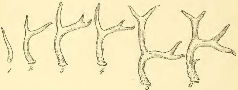
Fig. 1, spike of yearling; Figs. 2 and 3, antler at second year; Figs. 4 and 5, antlers at third year; Fig. 6, fully-developed antler as to form, but becoming heavier and rougher with age.

The antlers of these Deer vary greatly in the number of "points," deformity, rugose appearance, &c.