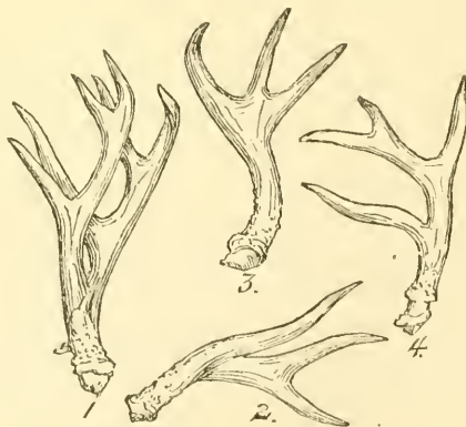
ABNORMAL GROWTHS.—Fig. 1, double antler with two brow-tines; Figs. 2, 3, and 4, deformed antlers from old deer.

The accompanying cut illustrates, in a general way, the appearance of the antler with each year's growth, until the fourth or fifth year, after which the normal appearance is that of Fig. 6.