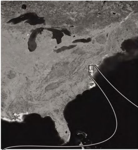
Figure 1: Satellite image (insert) of Eastern North America and below a portion of the northern section of Chesapeake Bay and parts of the States of Maryland and Virginia. The one black dot (immediately south of Parkers Creek, Calvert County, MD) marks the location where the Miocene stingray pathological mouthplate was found. Modified from VOGT et al. (2018).