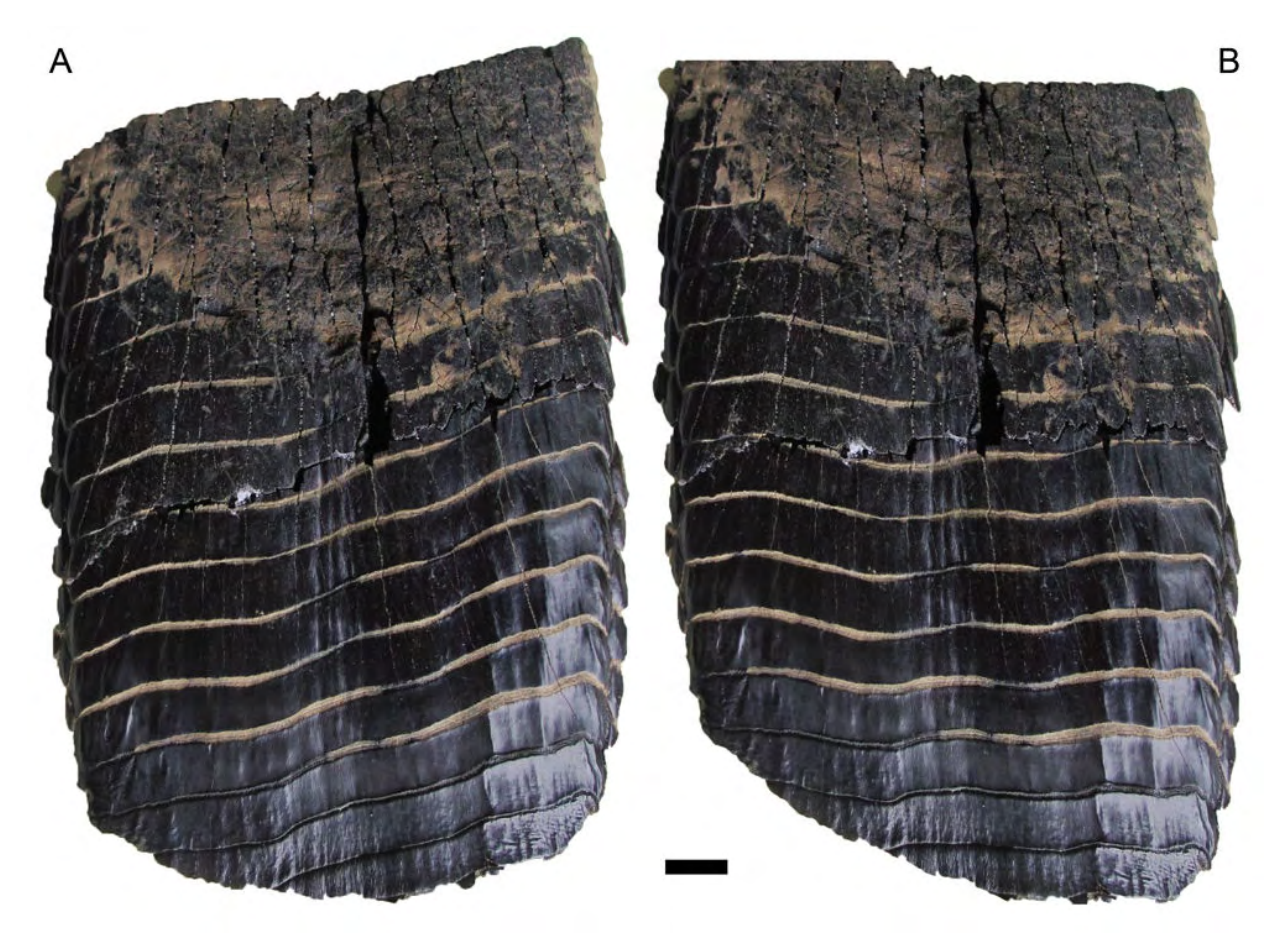
Figure 3: USNM PAL 726325 eagle ray ( Aetomylaeus sp.) partial tooth plate seen in occlusal view. A. Tooth plate showing its natural configuration preserving the semi-circular wear pattern on its anterior margin. B. Tooth plate altered in Photoshop® to correct for the right-hand skew. Now the wear pattern is skewed towards the posterior right. Scale bar equals 10 mm.

CAPPETTA (2012, Fig. 20) also described and figured a variety of chondrichthyan tooth abnormalities, but none in rays. GUDGER (1933) described unusual dentitions in rays. In the Myliobatidae, the dental abnormalities that he described consisted almost entirely of asymmetrical differences in tooth counts, only within the genus Myliobatis. Three published specimens show some similarity to USNM PAL 726325. They include a specimen attributed to the extant Aetobatus narinari (Hovestadt & Hovestadt-EULER, 2013, Pl. 14, fig. 1a), the fossil "Aetobatis" irregularis AGASSIZ, 1843 (HOVESTADT & HO-VESTADT-EULER, 2013, Pl. 28, fig. 1), where the teeth are not symmetrical, and the fossil form Myliobatis irregularis DIXON, 1850 (HOVESTADT & HOVESTADT-EULER, 2013, Pl. 31, fig. 1). HOVE-STADT and HOVESTADT-EULER (2013) reported that there is strong ontogenetic heterodonty in tooth morphology within Aetomylaeus. However, the skewed abnormal form of the teeth in USNM PAL 726325 is not the result of ontogenetic or sexual heterodonty, nor is it thought to be the result of the localized impaction of fin or tail spines, nor from modern or taphonomic deformation. It would be difficult to account for such a uniform taphonomic deformity given that the teeth are for the most part intact, showing no