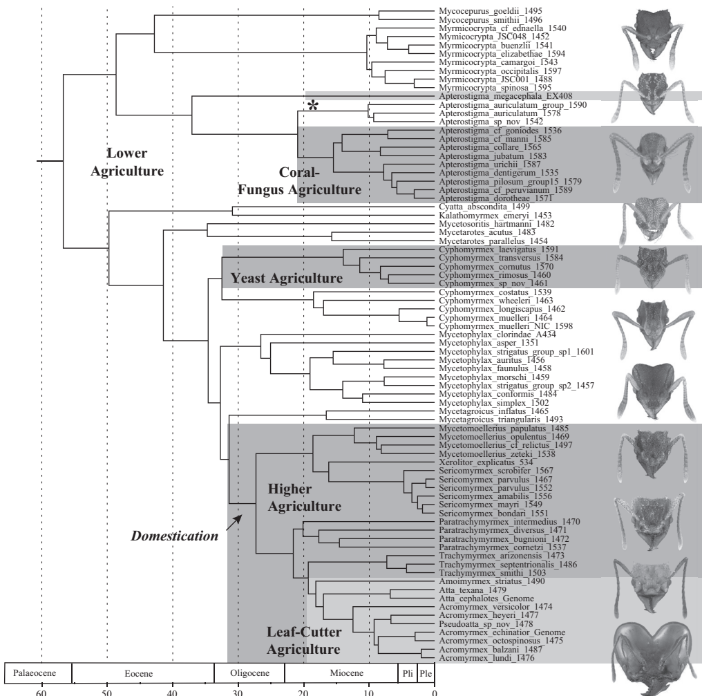
Figure 14.2 Time-dated chronogram of fungus-farming ants. Numbers at bottom indicate millions of years before present. The major agricultural systems (labeled) are characterized by the nearly monolithic fidelity of their component ants and fungi. The asterisk (*) indicates the only lower-attine ant species, Apterostigma megacephala , known to cultivate a higher-attine fungus. Adapted from Branstetter et al. (2017).

at least in lower and yeast agriculture there is occasional sexual recombination due to genetic continuity between cultivated and free-living populations. Importantly, horizontal transfer events are constrained by the boundaries of the five agricultural systems, i.e., the cultivation of a fungus from one agricultural system by an ant species from a different agricultural system is rare. Violations of the boundaries defining yeast agriculture and coral-fungus agriculture are entirely unknown, i.e., all observed associations occur solely between ants and fungi within those groups. Only one lower-attine ant species is known to cultivate a higher-attine fungus (figure 14.2) (Schultz et al. 2015), whereas a few non-leaf-cutting higher-attine ant species have been found cultivating lower-attine fungi (Mueller, Rehner, and Schultz 1998; Mueller et al. 2018; Solomon et al. 2019). Finally,