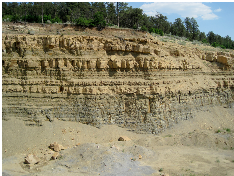
Figure 2. Photograph of part of the Kinney Brick Quarry in 2012. The floor of the quarry (lower right) exposes the basal limestone overlain by the primary fossil-producing interval of mostly dark gray shale. The higher wall of the quarry exposes delta-front and channel sandstones (compare to Figure 3).