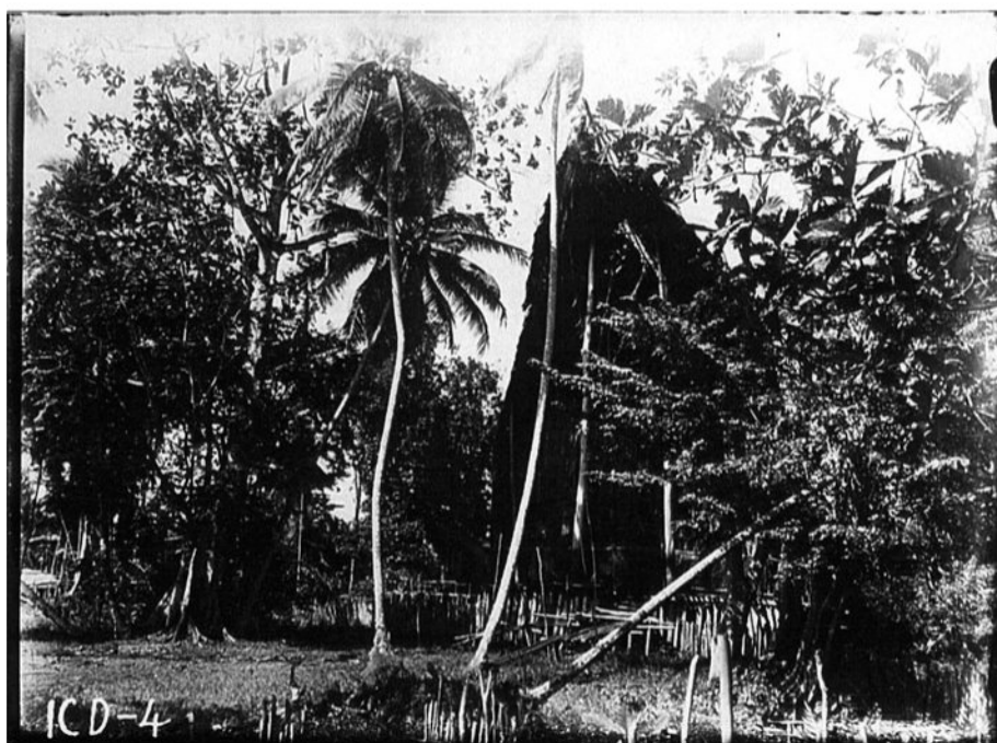
FIGURE 1. "Aikava Ravi (Iari)."