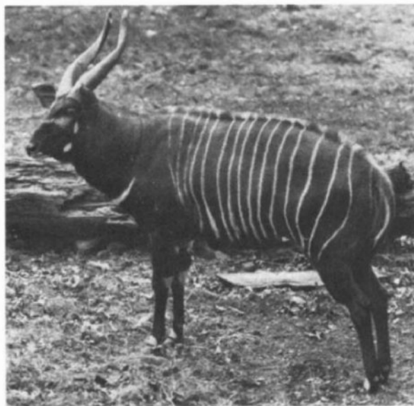
FIGURE 1. Photograph by Kent Redford of an adult male bongo, captured in Kenya, now at the National Zoological Park.

In East Africa, it is on Mt. Kenya, and in the Aberdare and Mau forests of Kenya. It no longer occurs in the Cherangani Hills and Chepalungu Forest (Anon., 1977). In view of the close resemblance between the distribution of the bongo and that of the giant forest hog, Hylochoerus meinertzhageni , it seems possible that the bongo may occur, or may once have occurred, in the montane