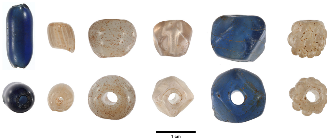
Figure 5. Glass bead varieties from site A-15, Brazil. From left: IIa54, IIb18, WIb5, WIIC2, WIIC11, and WIId1 (NMNH cat. no. A431302).

sites in the southeastern United States. Smith proposed four periods, of which only the third period is relevant here. At site A-3, beads that are diagnostic of Smith's 1600-1630 period are the star beads (IVk5) and the turquoise beads with white stripes (IIb56). Other bead varieties from A-3 that are present in the 1600-1630 framework and other periods are the gooseberry beads (IIb18) and turquoise beads (IIa40). The faceted chevron (IIIk3) is generally uncommon by 1600, but is known to occur in low numbers after that date (Loewen 2016; Smith 1987:33), especially in trade contexts that are not Spanish (Little 2010:224). Smith (1983: Table 1) dates compound seed beads from the southern United States to the 16th and 17th centuries, which likely includes IVa11 from A-3.