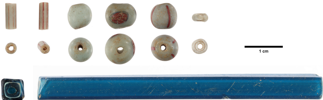
Figure 7. Glass bead varieties from site A-4, Brazil. Top rows, from left: Ib11 (6 stripes), Ib11* (8 stripes), Ila13, Iig3, Iib20, and IVa11. Bottom row: IIIc1 (NMNH cat. nos. A431223-431224).