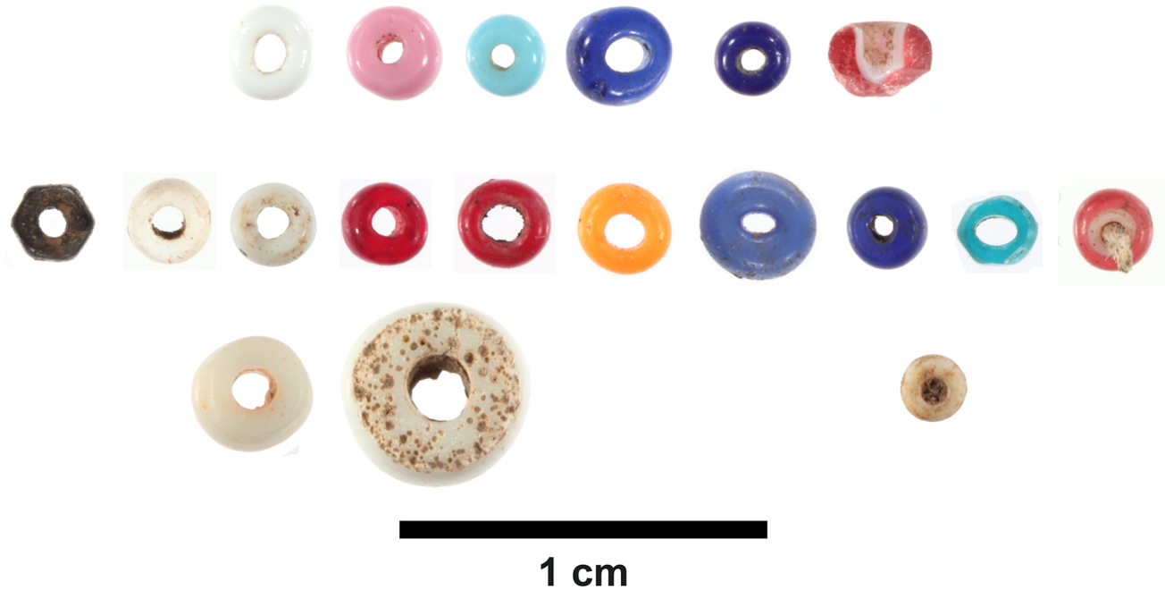
Figure 2. Glass bead varieties from sites in Guyana. Row 1) site E-28; Row 2) site E-2; Row 3, left) site R-20; Row 3, right) site R-1 (NMNH cat. nos. A419345, A419449, A419547, and A419595).