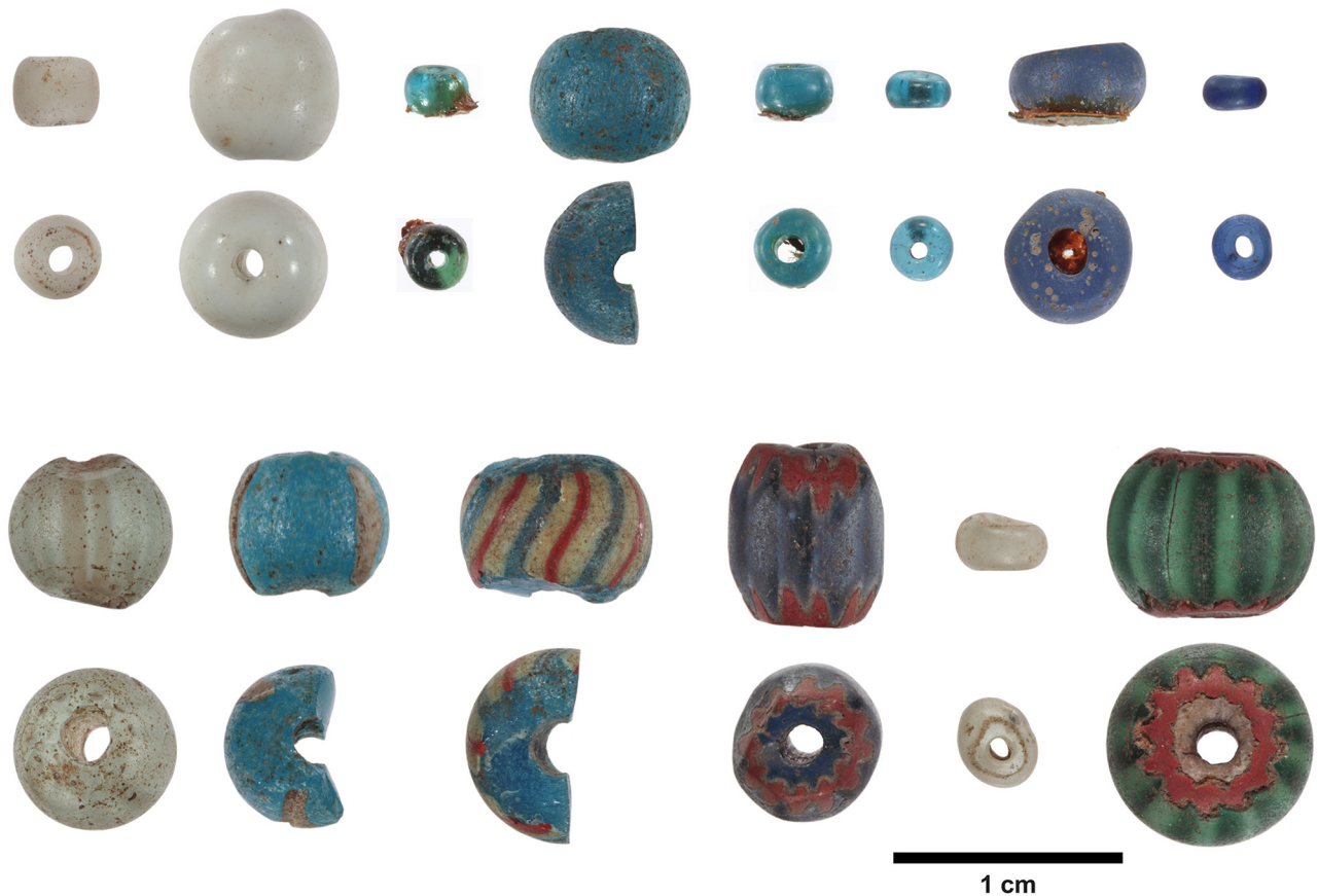
Figure 6. Glass bead varieties from site A-3, Brazil. Top rows, from left: IIA/IVa, IIA13, IIA*, IIA40, IIA41, IIA45, IIA47, and IIA56. Bottom rows, from left: IIB18, IIB56, IIBb'2*, IIIk3, IVA11, and IVk6 (NMNH cat. nos. A431220-431221).