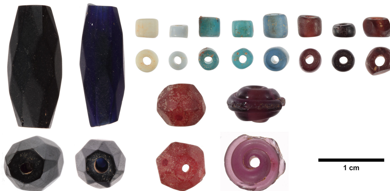
Figure 3. Glass bead varieties from site R-34, Guyana. Top rows and lower left, from left: If* (n=2), IIa* (n=7), and IIc* (n=1); Bottom center, from left: MPIIa* and MPII* (NMNH cat. nos. A419595 and A419600-419604).