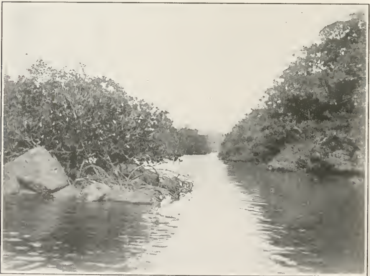
UPPER: COASTAL FOREST ON PULO JIMAJA, ANAMBA ISLANDS, THE HOME OF HORIZILLAS MAGNIROSTRIS AND AETHOPYGA SIPÁRAJA OCHROPYRRHA .