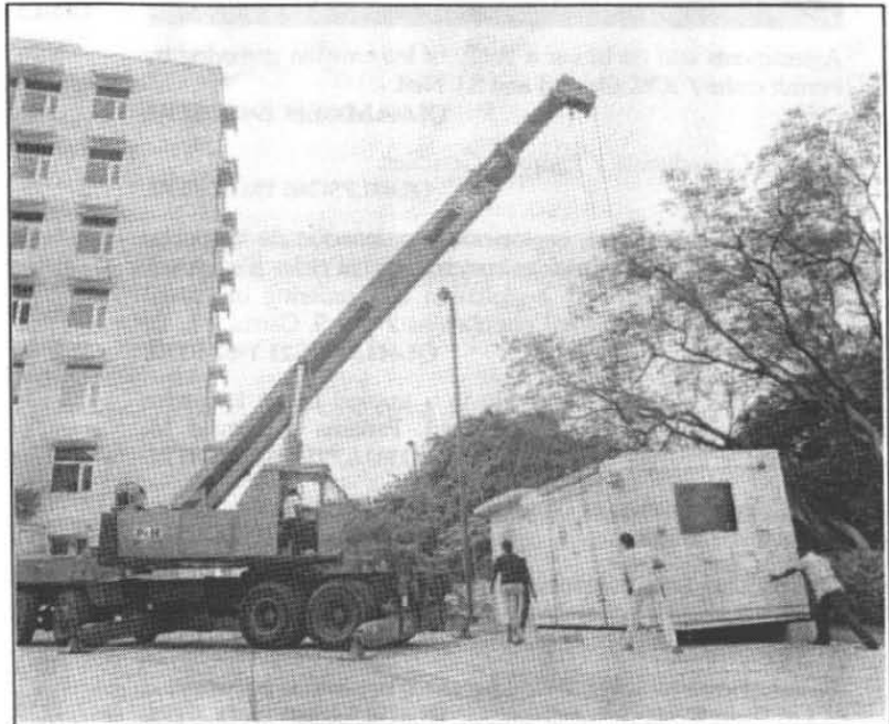
On Tuesday, Oct 27, a new chemical waste storage container was installed at the Tupper Center parking lot. This is one of four prefabricated safety units purchased for STRI. Two of them were installed at Naos and the fourth, is located in Gamboa to be eventually installed on BCI. These containers have fire protection and explosion proof systems and air conditioning.