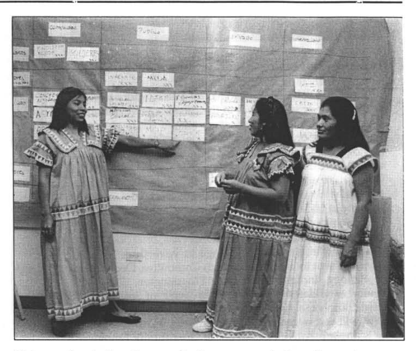
This week at the Tupper Center, representative Guaymi women participated in the planning workshop for an agroforestry project to be carried out in the Chiriqui Guaymi area ••• Durante esta semana en el Centro Tupper, representantes de mujeres Guaymí participaron en el seminario-taller de planificación de un proyecto agroforestal que se llevará a cabo en el área Guaymí de Chiriquí.

On a planet that's three-fifth submerged in H<sub>2</sub>O, it seems absurd to think that water could ever be scarce. Nevertheless, clean fresh water may soon become a luxury. Polluted lakes and streams, and pumping from saltwater sources, threaten the survival of many animal species. Underground reservoirs are being emptied faster that they can refill, and many natural replenishments ----such as rainfall and agricultural runoff-are returning tainted water to previously pure sources. Water conservation as a way of life will save energy and help keep a reliable supply of fresh water on tap.