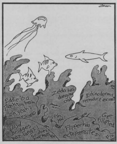
Coral reef grafitti