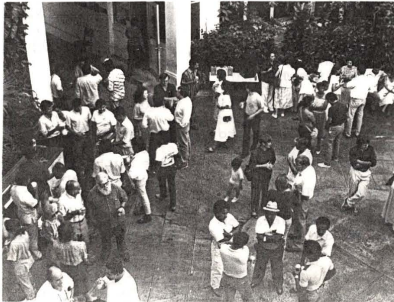
December 22, 1988, STRI Christmas Party in the Ancon courtyard.