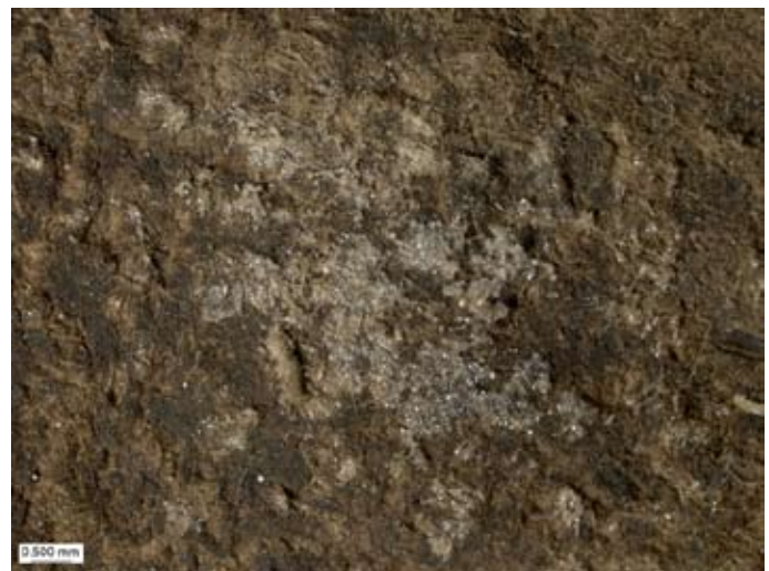
Figure 3. Leather substrate bearing a thin, crystalline coating.

This paper focuses on analysis of the Ndebele objects that have degrading glass beads, some that appeared to be coated. A greasy coating was found on many pieces of costume, jewelry and ceremonial regalia (e.g., women's pelvic aprons, children's breastplates, pendants and a ceremonial staff). The coating did not appear to be associated with a leather dressing given that it was found on cotton canvas and cotton knit objects as well as beaded jewelry with no substrate (Figure 2 and Figure 3). This coating was not only found on the substrates but also appeared to have been applied directly to the beads.