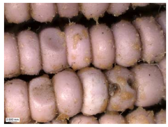
Figure 5. Unstable glass bearing a thickened, yellow coating. Qualitative glass compositional analyses and identification of degradation products were undertaken with µ-XRF.

1) Stable glass beads bearing a thin, transparent coating