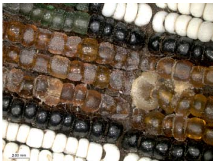
Figure 6. Unstable glass bearing an engulfing, opaque coating. Qualitative glass compositional analyses and identification of degradation products were undertaken with \mu -XRF (Photo: Mel Wachowiak and Maria Fusco, Museum Conservation Institute, Smithsonian Institution).