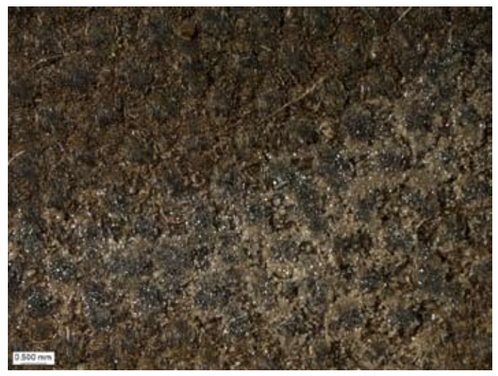
Figure 2. Cotton canvas substrate bearing a thin, crystalline coating.

bead degradation to some degree. These objects included mid-to-late twentieth-century costume, jewelry and ceremonial regalia (Figure 1). Fields of multi-colored opaque and translucent glass beads covered the majority of leather and cotton substrates; jewelry was without substrate.