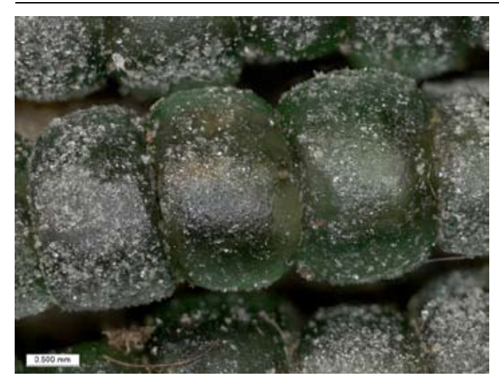
Figure 4. Stable glass bearing a thin "sugary" coating. Qualitative glass compositional analyses were undertaken with μ-XRF.

As is often the case with beaded art, certain colors of glass seemed more susceptible to degradation than others. Furthermore, the degrading beads appeared to have chemically interacted with the greasy coating. Stable beads were physically intact and bore a coating that was transparent and thin, like a sugary glaze (Figure 4). The extent of the degraded beads ranged from moderate to severe cracking to complete dissolution. On the surface of most degrading beads, coatings were present that had thickened and yellowed or become opaque (Figure 5 and Figure 6). For the purposes of this discussion, these categories can be drawn: