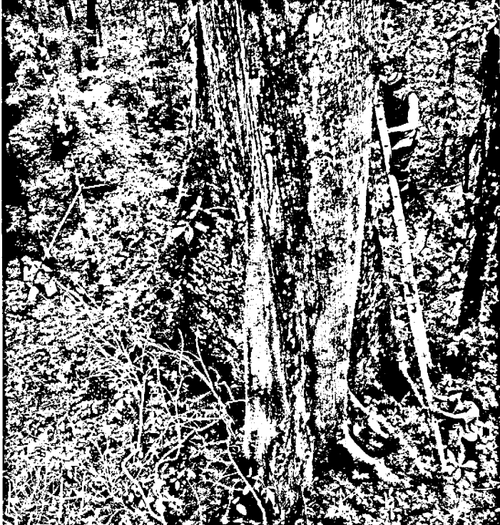
Researchers measuring trees at Barro Colorado Island, Panama

The Smithsonian Institution is uniquely positioned to eonduet interdisciplinary research on complex biological systems at a global scale. It will do this by expanding and deepening its eollaborative ventures among units including the National Zoological Park's (NZP) Conservation and Research Center (CRC), the National Air and Spaee Museum (NASM), the National Museum of Natural History (NMNH), the Smithsonian Astrophysical Observatory (SAO), the Smithsonian Environmental Research Center (SERC) and STRI.