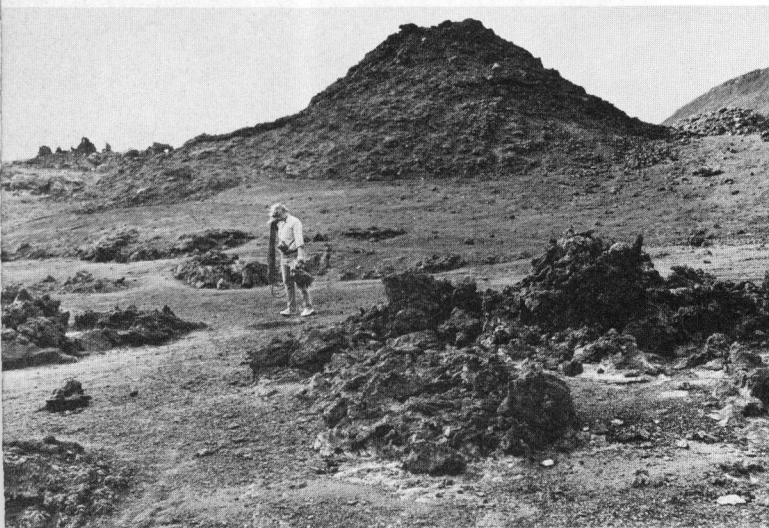
The author heads for the volcanic cone where British ornithologists had found some bird skulls.

Only later, at the British Museum, was it discovered that one of the skulls belonged to a small rail, but without the rest of the skeleton there was no way to know for sure if this was Mundy's bird. It was never given a scientific name in the hopes that the rest of its