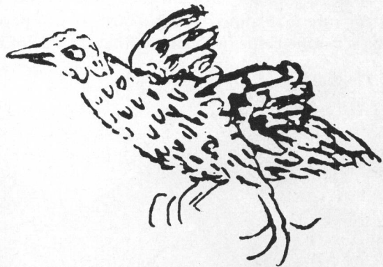
Mundy's sketch, the only one, of his "fowle."

"Att evening wee arrived att Ascention and anchored on the NW. side of the iland. . . . Some of our company went up and broughtt downe six or seven goates, doubtlesse att first left there by the Portugalls: allsoe halfe dozen of a strange kind of fowle, much bigger then our sterlings . . . collour gray or dappled, white and blacke feathers intermixed, eies red like rubies, wings very imperfitt, such as wherewith they cannott raise themselves from the ground. They were taken running, in which they are exceeding swift, helping themselves a little with their wings . . . shortt billed, cloven footed, thatt can neither fly nor swymme. It was more then ordinary dainety meatt, relishing like a roasting pigge."