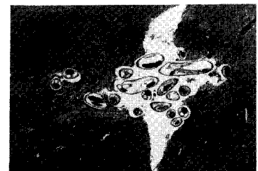
Fig 1—Photomicrograph of the medulla of a sable antelope (antelope 1), indicating numerous sections of immature Parelaphostrongylus tenuis . H&E stain; ×14.

Complete necropsies were performed on both sable antelope, as described for the reindeer. A moderate amount of clotted blood was found subdurally around the cerebellum and medulla of antelope 1, but the remainder of the CNS was normal grossly. In antelope 2, multifocal meningeal hemorrhages were seen along the cervical and thoracic segments of the spinal cord. The cord was sectioned in these areas and focal cavitations and hemorrhages were seen in the