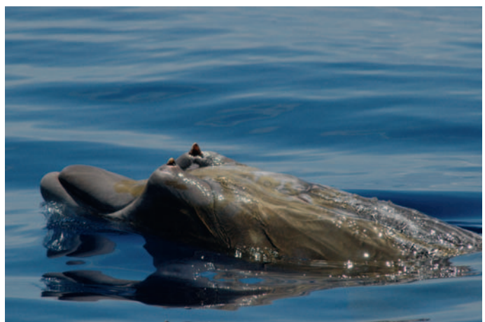
Figure 4 Teeth and Tusks. Blainville's beaked whales (Mesoplodon densirostris) have a single pair of teeth (which may be better described as tusks) in the lower jaw which appears to primarily function in male-male aggression. Stalked barnacles (Conchoderma auritum) often grow in clusters on the erupted teeth, enlarging their effective size and increasing the abrasiveness of the tusks. Adult males also have a distinctive ridge along the dorsum, posterior to the blowhole, which appears to be the area targeted during intra-specific fighting, resulting in heavy scaring from tooth-rakes of other adult males (Diane Claridge, personal observation.). The densely ossified rostral bone may function to reinforce the skull when males fight.

females (which weigh 350–800 kg). Males in some species also possess greatly enlarged TEETH that are lacking in females and are used in fights between males. The best known example is the unicorn-like tusk of the NARWHAL ( Monodon monoceros ). The tusk, which is actually a greatly enlarged left upper tooth, usually erupts only in males and can grow to an extraordinary size, exceeding 3 m in length and 10 kg in weight. In some odontocete species (e.g., bottlenose whales, genus Hyperoodon ), males have greatly enlarged and densely ossified heads, which they use to ram other males during fights. In otariids, males have thick necks and massive chests that tend to be covered by a dense mane of hair. The noses of males are sometimes bizarrely modified. For example, the most distinctive feature of the male hooded seal ( Cystophora cristata ) is an inflatable