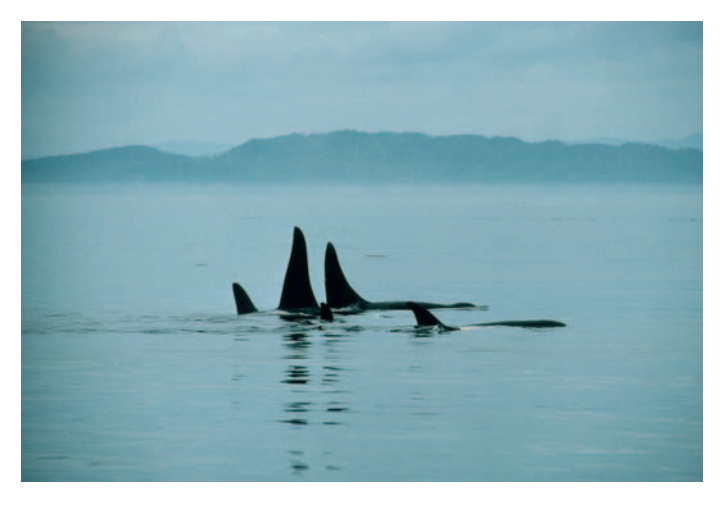
Figure 2 Dorsal fins. A pod of killer whales (Orcinus orca), Alaska. In adult males, the dorsal fin is erect and may grow to 1.8m in height whereas the dorsal fins of females are less than 0.7m and distinctly falcate. Sexual dimorphism also occurs in body size, flipper size, and genital pigmentation pattern.