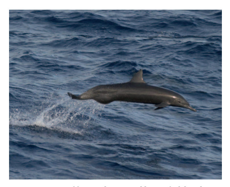
Figure 6 Post-anal hump. The post-anal hump of adult male east ern spinner dolphins (Stenella longirostris orientalis) is tremendously exaggerated. The dorsal fin of adult males is also forward-canted and the tips of the flukes curl up.

Although sexual dimorphism traditionally referred to differences in morphological traits, the sexes can also produce different vocalizations or odors or be differently colored or patterned. Among marine mammals, differences in color are usually limited to fairly minor differences in pattern or density of pigmentation. For example, in ribbon seals (Histriophoca fasciata), the banding pattern is similar in both sexes but paler and less distinct in females. There are numerous examples of sexually dimorphic vocalizations in marine mammals, such as the roars and bellows of male sea lions and fur seals (Otariidae), the songs of male humpback whales (Megaptera novaeangliae), and the loud clicks of male sperm whales (P. macrocephalus). In terrestrial mammals, males and females often produce different scents via urine, feces, or specialized scent glands. This has not been observed much in marine mammals but may well occur. It is known, for example, that male ringed seals (Pusa hispida) produce a strong odor in the breeding season. Male sea otters (Enhydra lutris) frequently investigate the anogenital areas of other otters, and male common bottlenose dolphins (Tursiops truncatus) investigate the genital region of possibly estrous females with their rostrums.