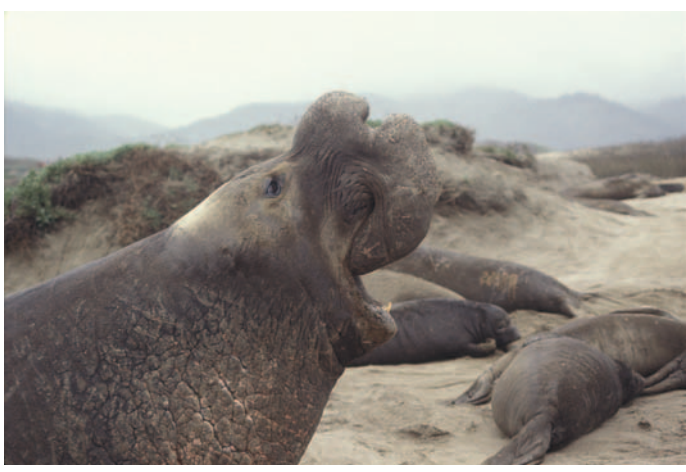
Figure 5 Noses. Threat vocalizations resonate in the greatly enlarged proboscis of adult male northern elephant seals (Mirounga angustirostris), Año Nuevo, California. There is extreme dimorphism in body size and shape; males grow maximally to 4m and 2300kg and females to 3m and 360–710kg. The skin on the neck of adult males is thick, rugose, and scarred by fights and the canine teeth are sexually dimorphic in size and shape. Males are darker brown than females.

hood and bright red nasal sac that may function in agonistic and courtship displays. The appendages of males (flippers, flukes, caudal peduncles, and dorsal fins) are sometimes greatly enlarged. The best-known example of dorsal fin enlargement is seen in male killer whales ( Orcinus orca ; Fig. 2).