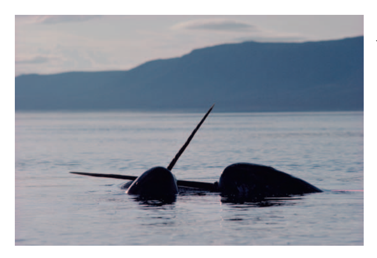
Figure 3 Teeth and Tusks. Dueling male narwhals (Monodon monoceros), Canada. The unicorn-like tusk of the narwhal is actually a greatly enlarged left upper tooth. The tusk generally erupts only in males and may exceed 3m in length and 10kg in weight. Sexual dimorphism also occurs in body size, pigmentation pattern, and the shape of the flukes and pectoral fins.

females (which weigh 350–800 kg). Males in some species also possess greatly enlarged TEETH that are lacking in females and are used in fights between males. The best known example is the unicorn-like tusk of the NARWHAL ( Monodon monoceros ). The tusk, which is actually a greatly enlarged left upper tooth, usually erupts only in males and can grow to an extraordinary size, exceeding 3 m in length and 10 kg in weight. In some odontocete species (e.g., bottlenose whales, genus Hyperoodon ), males have greatly enlarged and densely ossified heads, which they use to ram other males during fights. In otariids, males have thick necks and massive chests that tend to be covered by a dense mane of hair. The noses of males are sometimes bizarrely modified. For example, the most distinctive feature of the male hooded seal ( Cystophora cristata ) is an inflatable